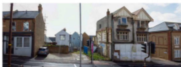
Proposed Neighbouring Building

Note the more sympathetic scale of the pre-demolition building at 26 Leigh Hill. The replacement is two stories higher (with its gable) at its frontage to Leigh Hill and dramatically more imposing in the street scene, conservation area and upon the setting of the listed building.