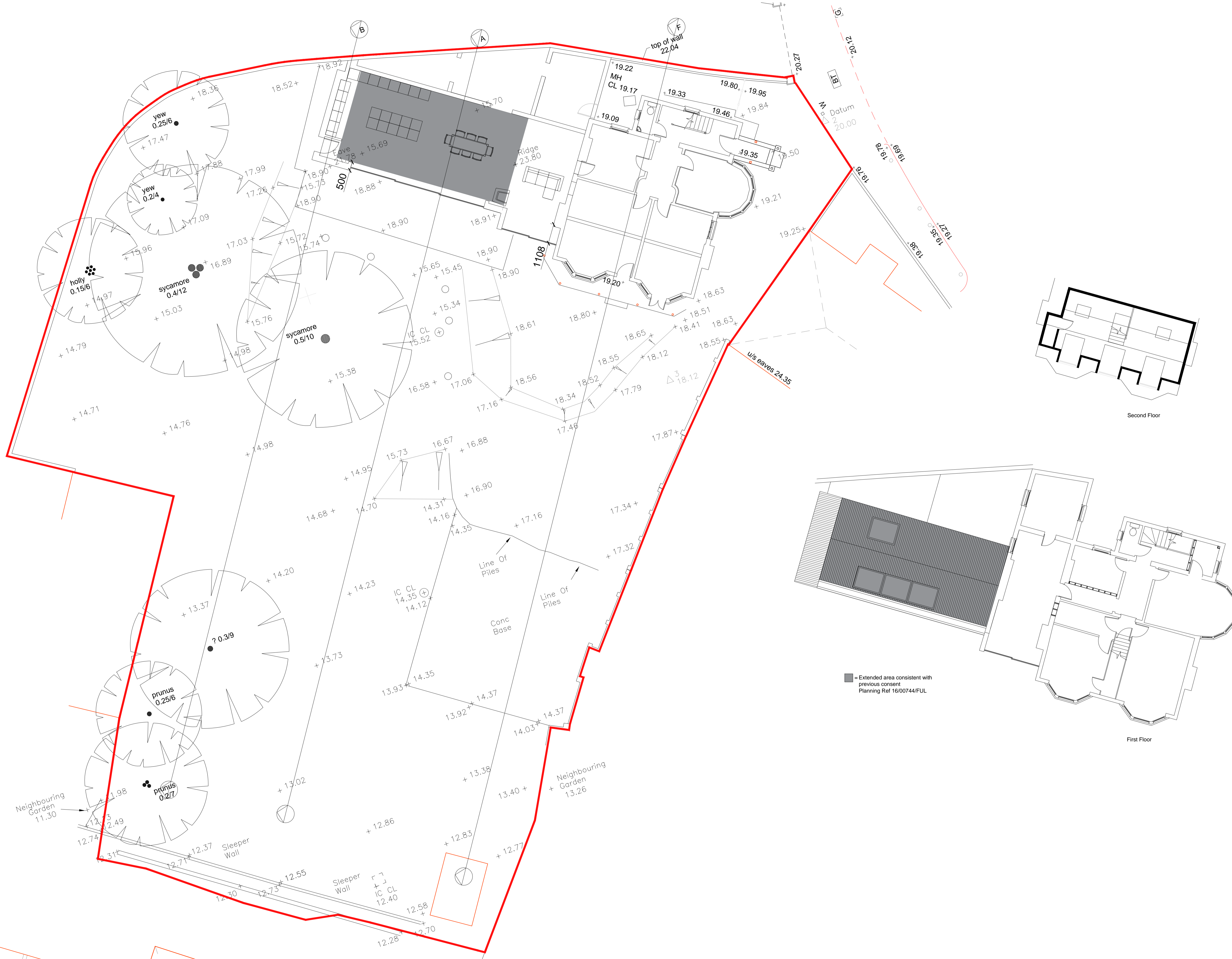
Existing Plans Ground Floor