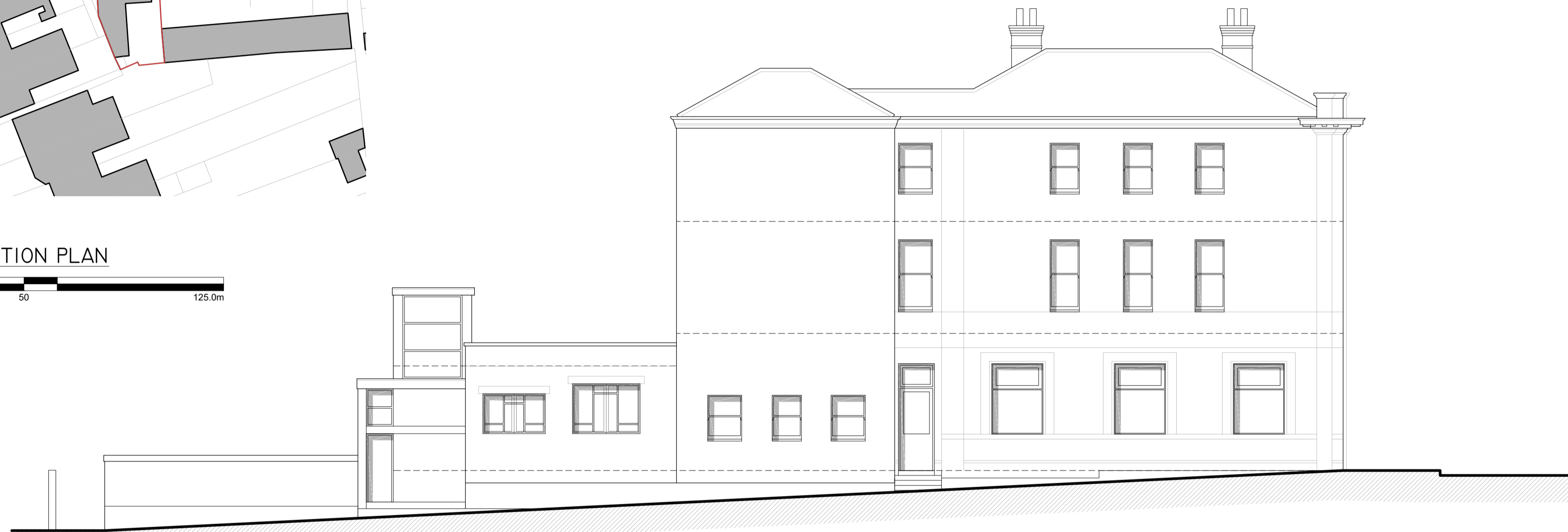
EAST ELEVATION SCALE 1:100

The contractor is to check and verify all building and site dimensions, levels, and sewer invert levels at connection points before work starts. This drawing must be read with and checked against any structural or other specialist drawings provided. Any discrepancies found on this drawing are to be notified to STONE MEI DESIGN LTD prior to commencement of work. The contractor is to comply in all respects with the current Building Regulations whether or not specifically stated on these drawings. This drawing is not intended to show details of foundations or ground conditions. Each area of ground relied upon to support the structure depicted must be investigated by the contractor and suitable methods of foundations provided. This drawing is to be read in conjunction with all other standard STONE MEI DESIGN LTD specifications and documentation. STONE MEI DESIGN LTD reserves the right to withdraw any drawings from any applications or third parties should disputes arise between the client and STONE MEI DESIGN LTD. This drawing remains the copyright of STONE MEI DESIGN LTD and cannot be reproduced without prior permission.