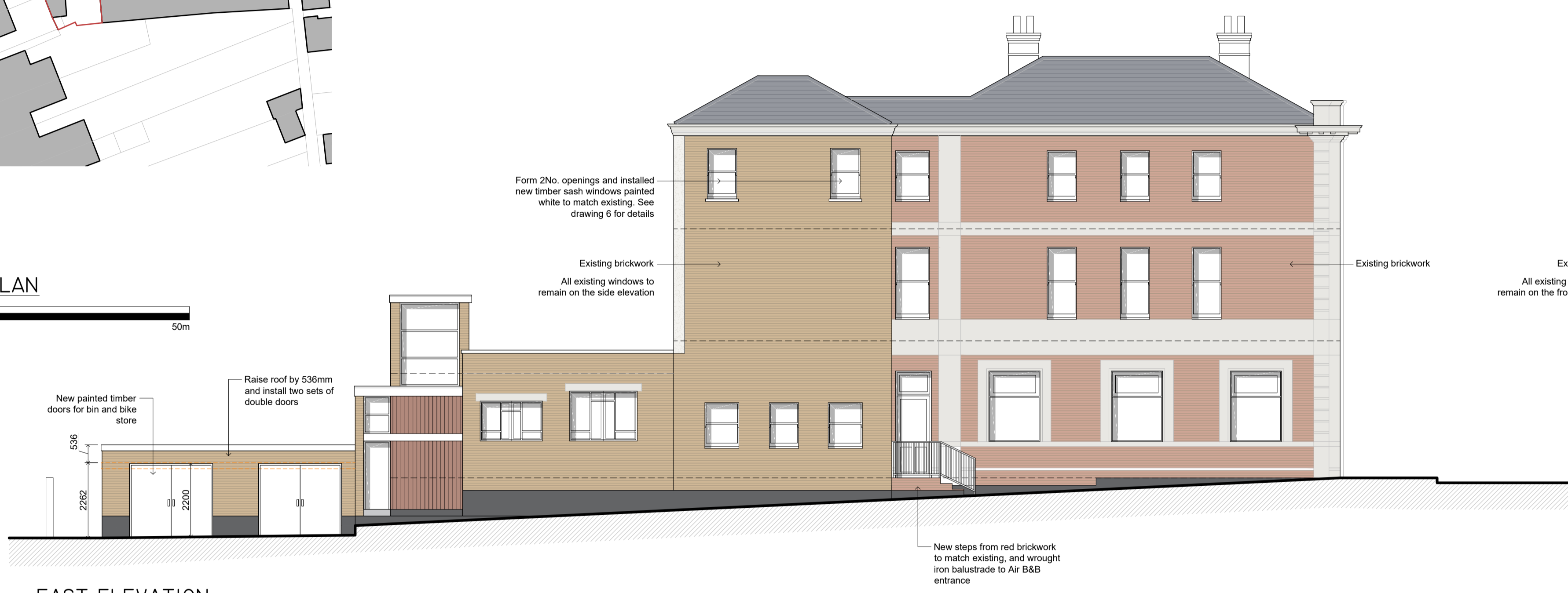
EAST ELEVATION SCALE 1:100

The contractor is to check and verify all building and site dimensions, levels, and sewer invert levels at connection points before work starts. This drawing must be read with and checked against any structural or other specialist drawings provided. Any discrepancies found on this drawing are to be notified to STONE MEI DESIGN LTD prior to commencement of work. The contractor is to comply in all respects with the current Building Regulations whether or not specifically stated on these drawings. This drawing is not intended to show details of foundations or ground conditions. Each area of ground relied upon to support the structure depicted must be investigated by the contractor and suitable methods of foundations provided. This drawing is to be read in conjunction with all other standard STONE MEI DESIGN LTD specifications and documentation. STONE MEI DESIGN LTD reserves the right to withdraw any drawings from any applications or third parties should disputes arise between the client and STONE MEI DESIGN LTD. This drawing remains the copyright of STONE MEI DESIGN LTD and cannot be reproduced without prior permission.