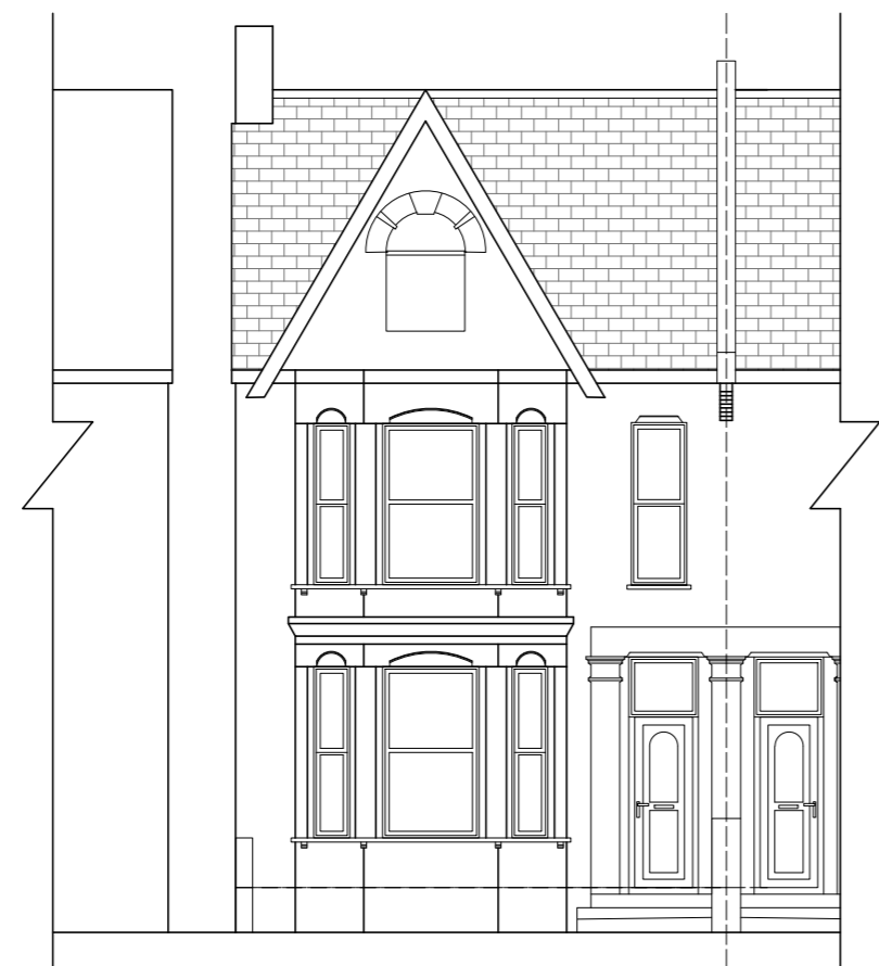
EXISTING FRONT ELEVATION SCALE 1:100 0 1 2 3 4 5m

NOTES: Do not scale this drawing. Work to figured dimensions only. Check all dimensions on site. Confirm any discrepancies prior to commencement of work.