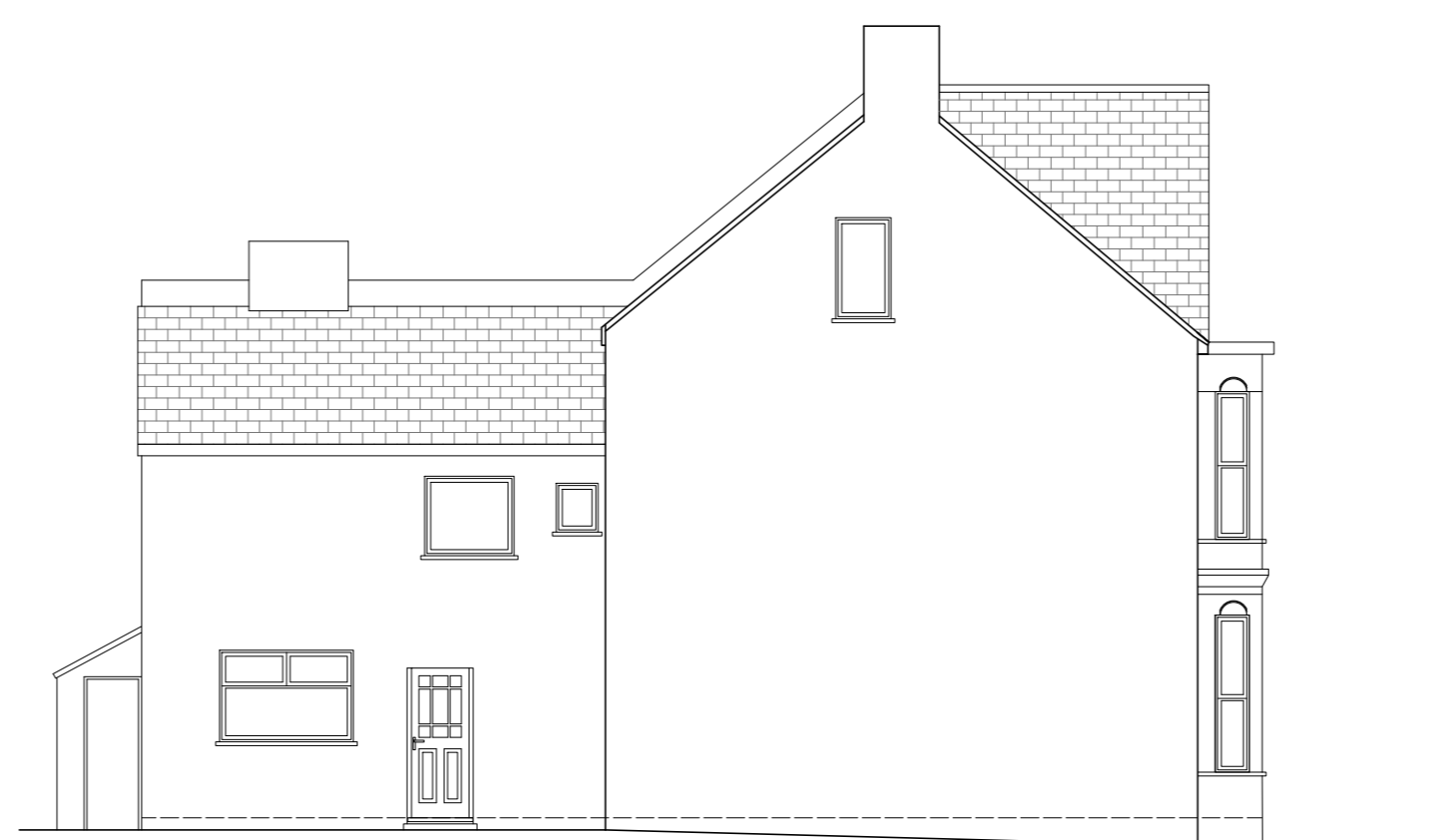
EXISTING LEFT ELEVATION SCALE 1:100 0 1 2 3 4 5m