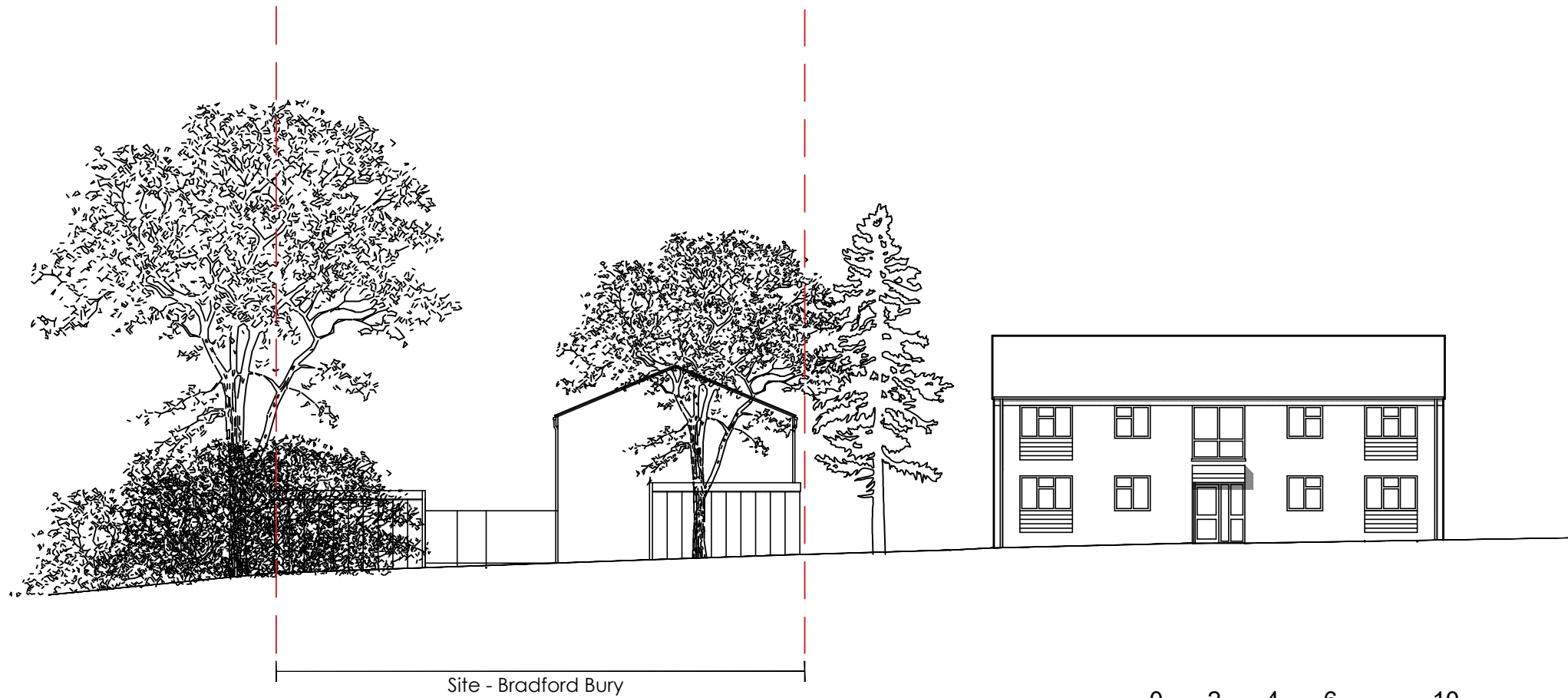
Street Elevation - West