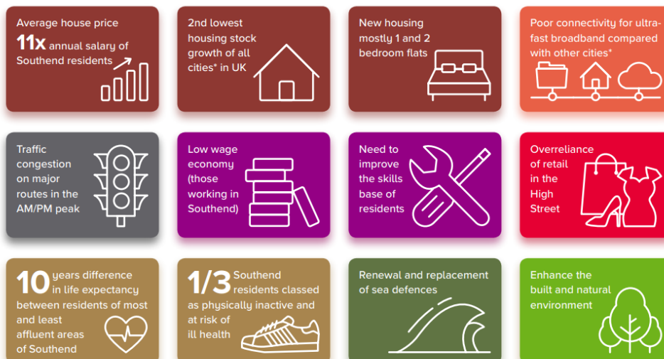
▼ Figure 7: Challenges