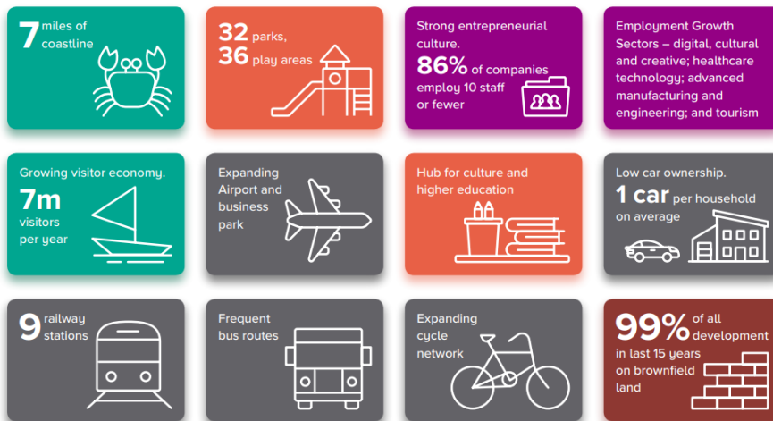
▼ Figure 6: Strengths and Opportunities