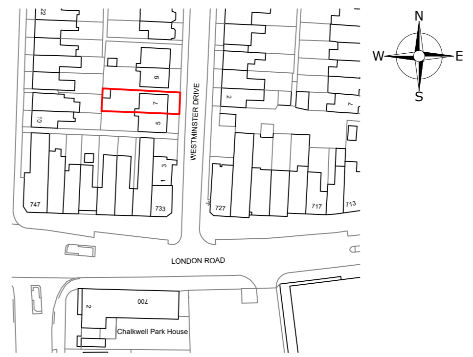
LOCATION PLAN SCALE 1:1250 0 10 20 30 40m