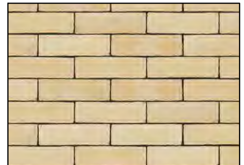
EXISTING BOUNDARY WALL - BUFF