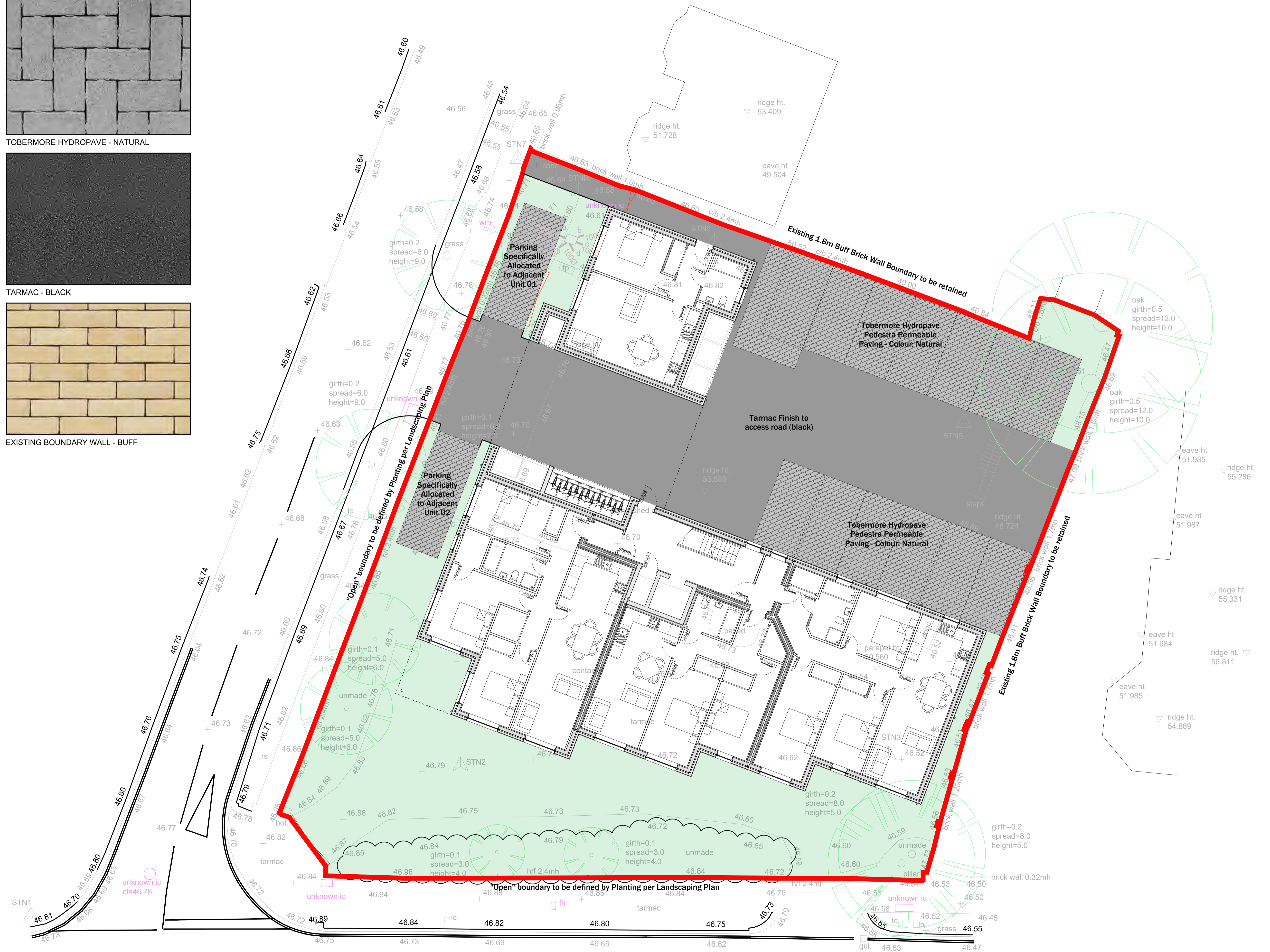
PROPOSED SITE PLAN Scale 1:100@A1

Revision B Parking amended at Front of Development 01.09.2024 Revision A First Issue 18.09.2023