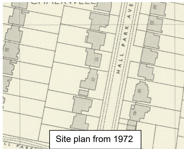
Site plan from 1972