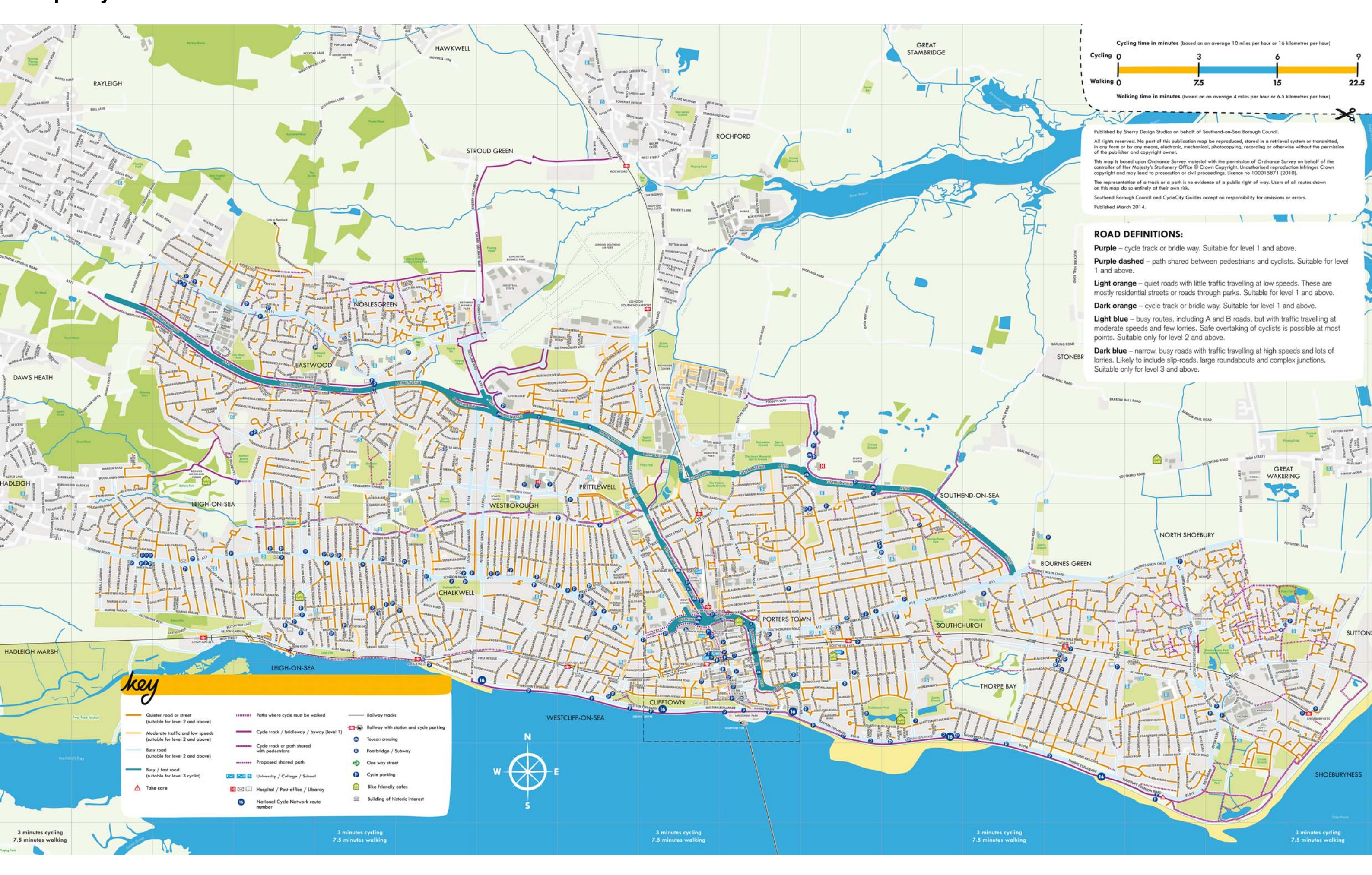
Map 1 - Cycle Network