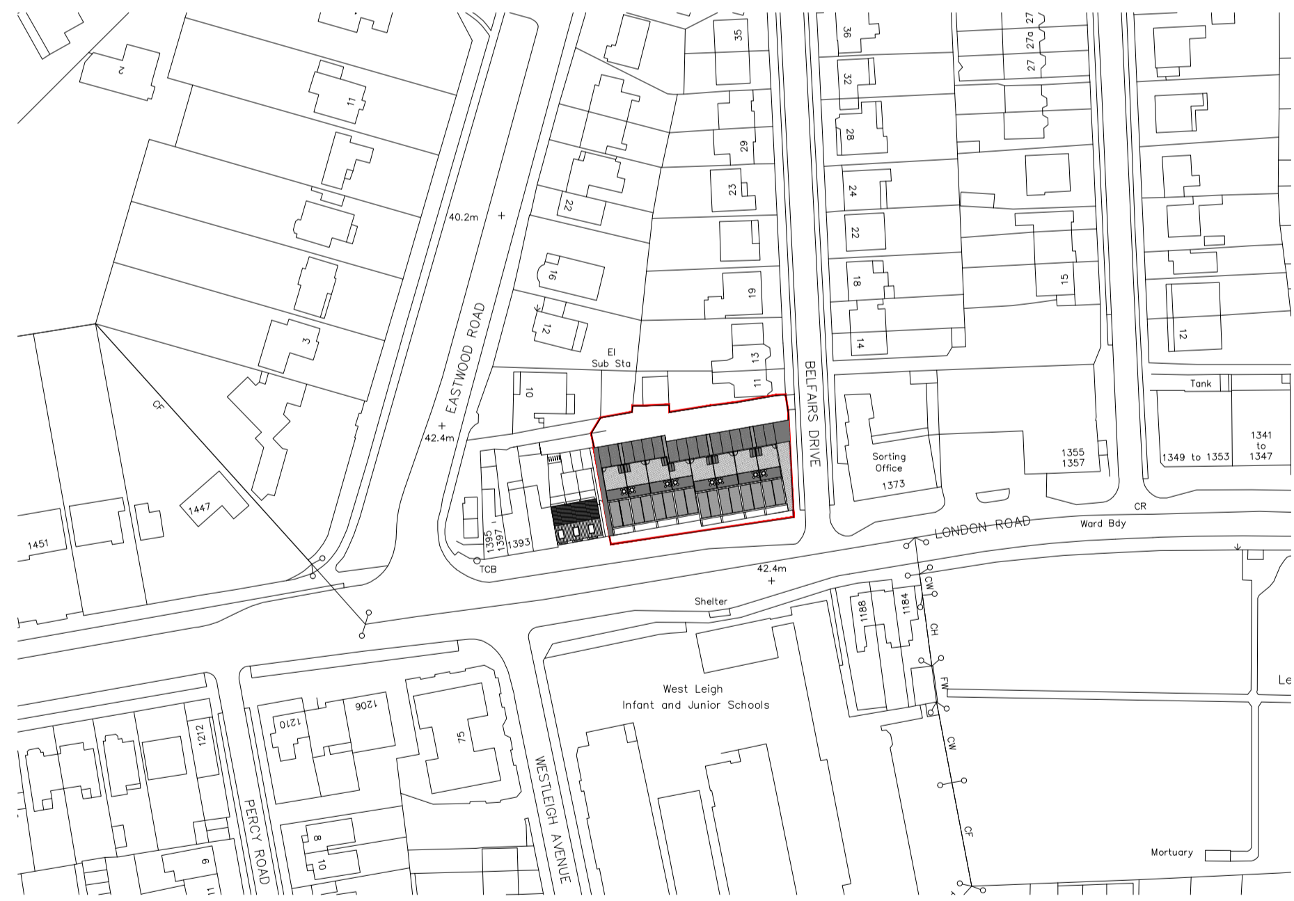
Proposed Location Plan - 1:1250