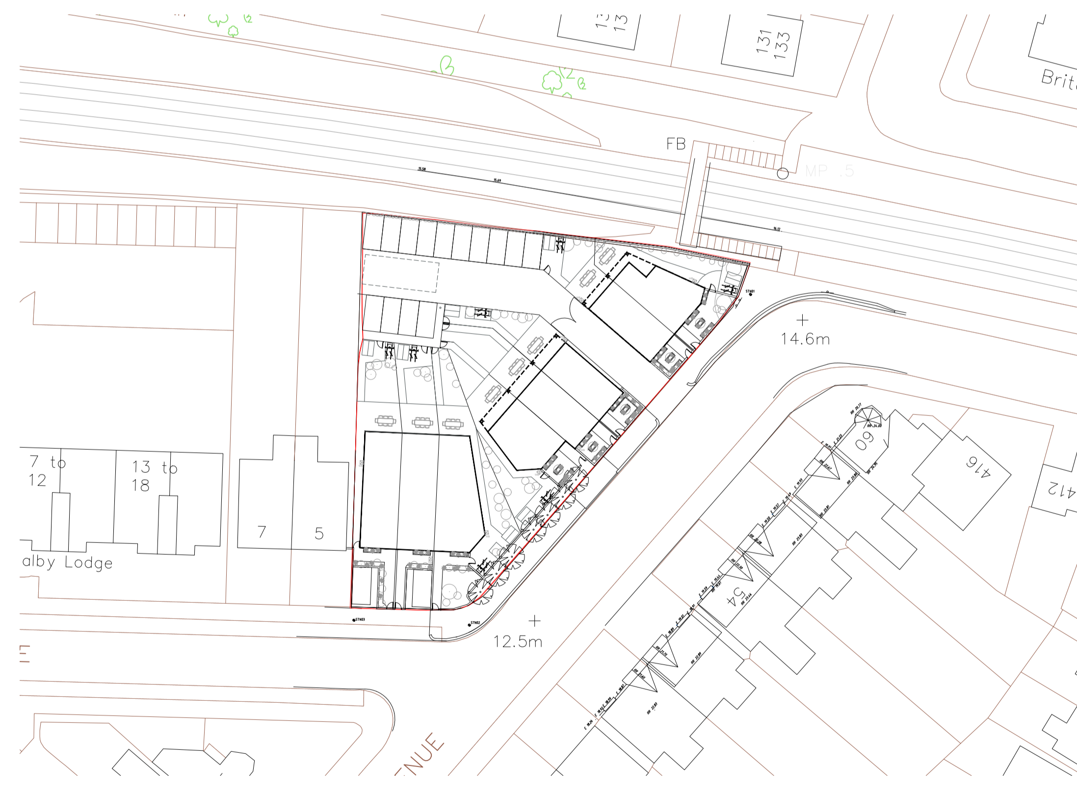
Proposed Block Plan - 1:500