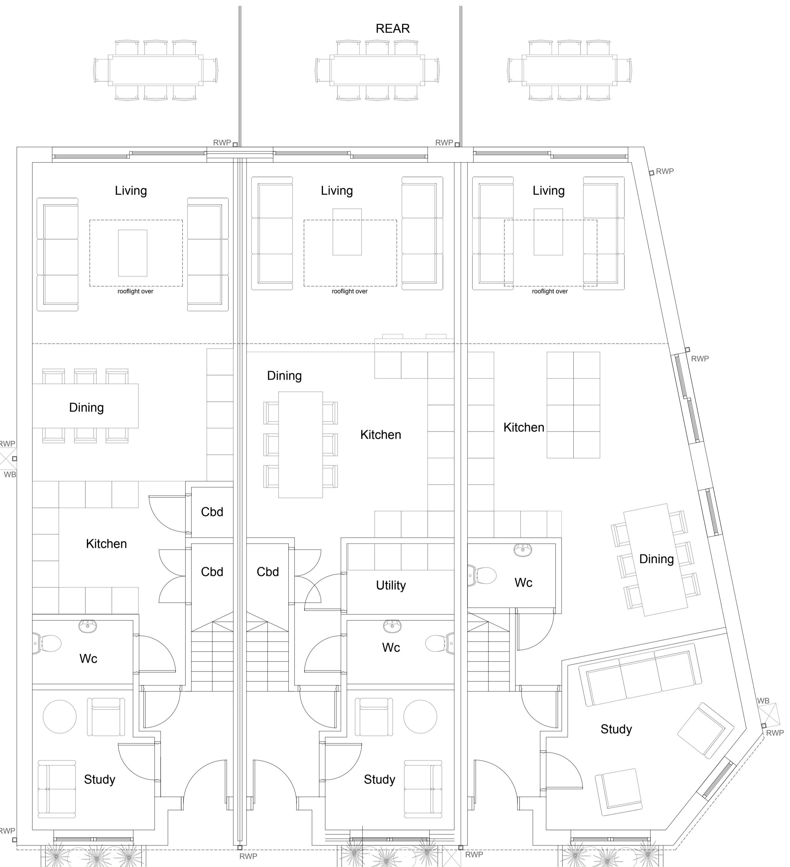
H1 GROUND FLOOR FOR FRONT AND REAR GARDEN LAYOUT, PLEASE SEE DRG NO.363/P02