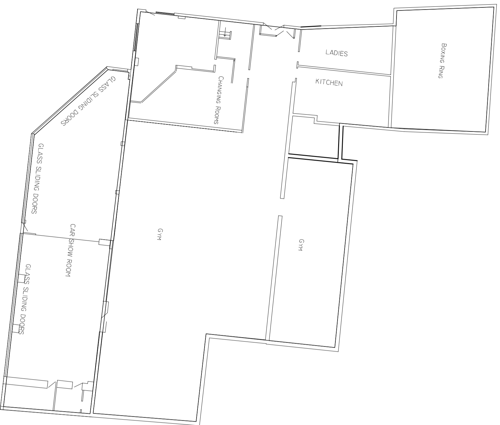
GROUND FLOOR PLAN SCALE 1:200