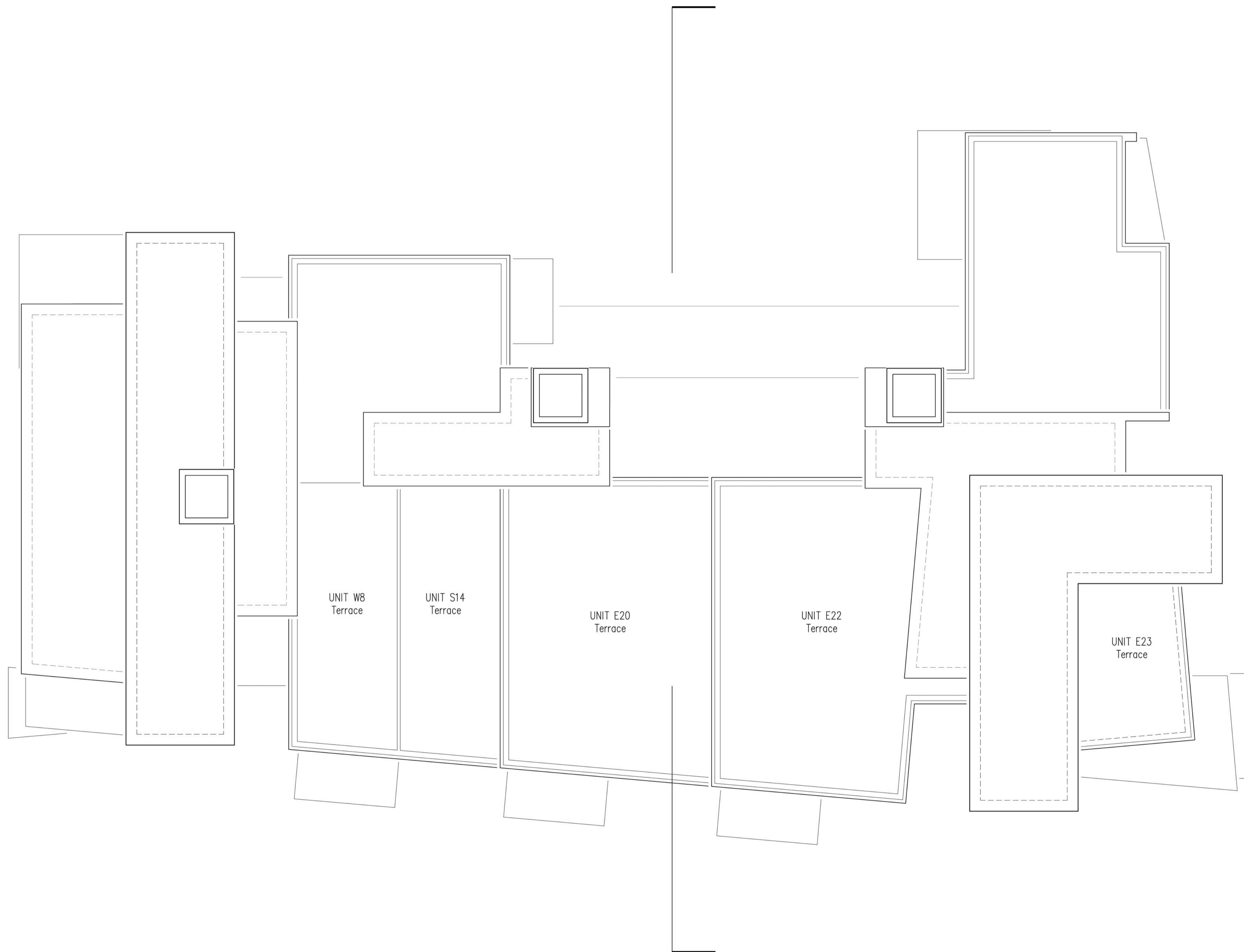
Existing Roof Plan