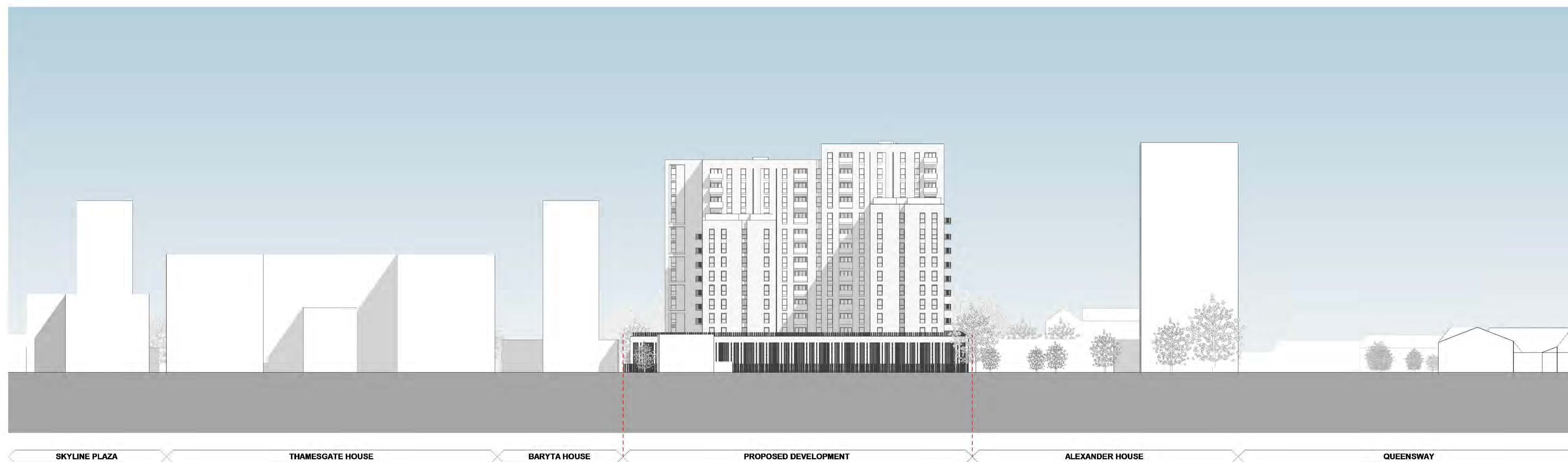
Street Elevation B-B' - Baxter Avenue - Proposed 1 : 500