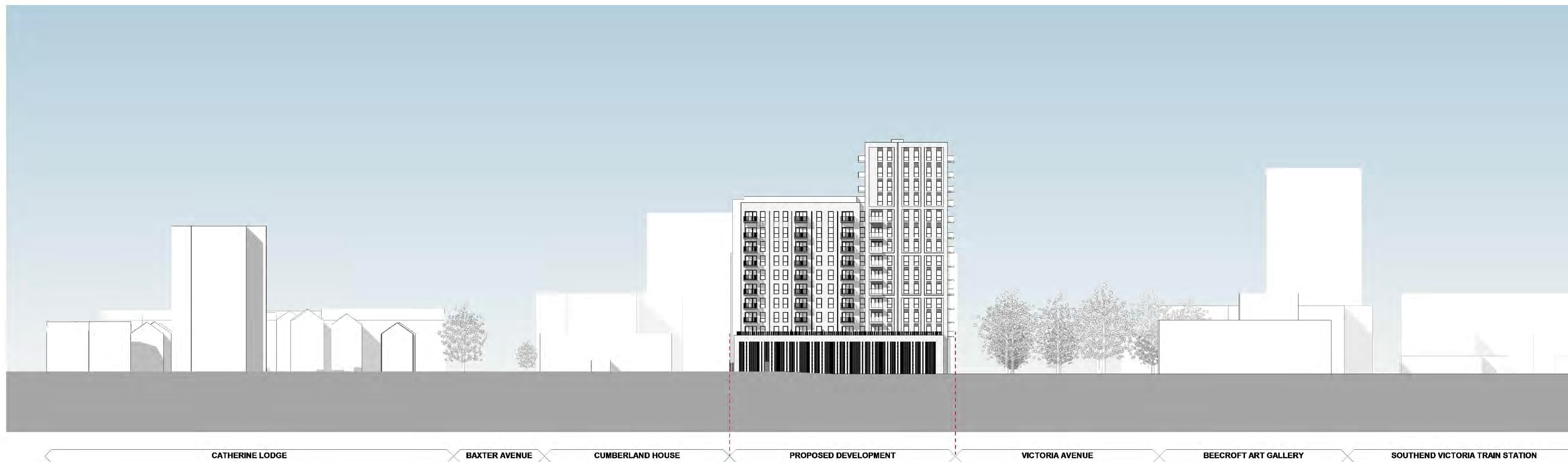
Street Elevation C-C' - South - Proposed 1 : 500