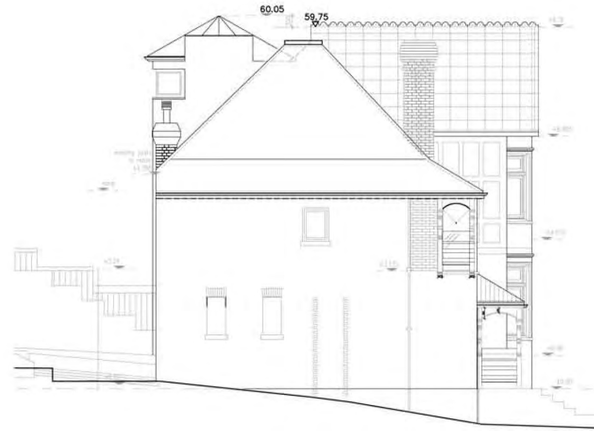
P300 Proposed West Elevation 2 Leigh Park Road