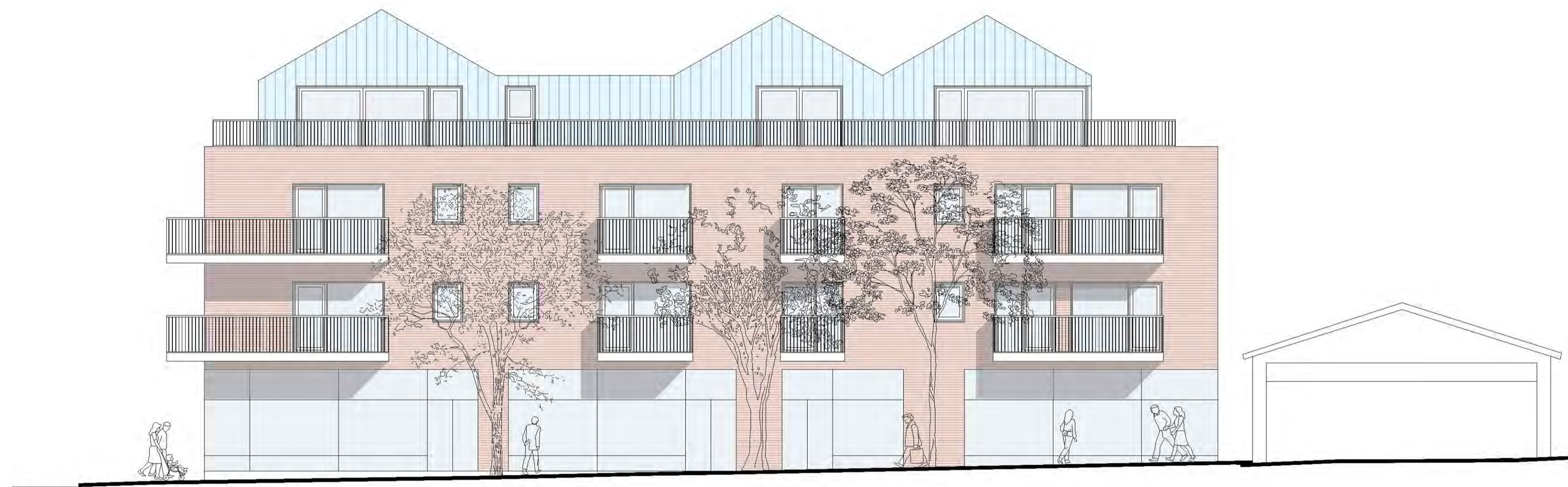
Proposed North Facing Elevation 1:100