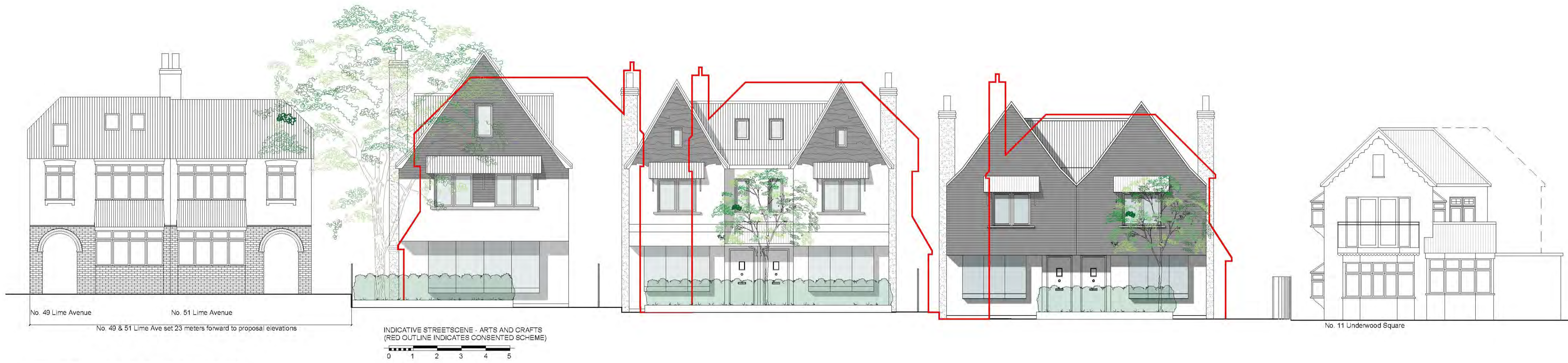
INDICATIVE STREETSCENE FOR FUTURE DEVELOPMENT - 1:100