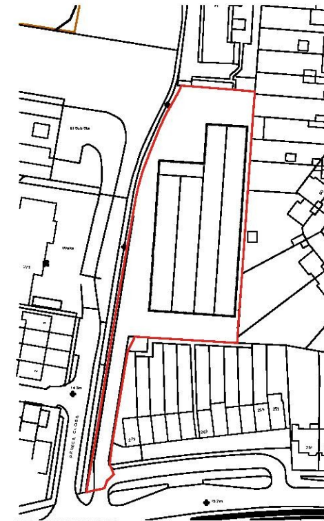
SITE LOCATION PLAN SCALE: 1:1250@A4