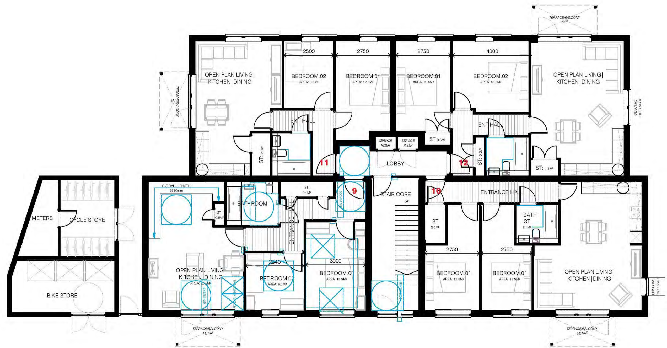
FLATS: PROPOSED GROUND FLOOR PLAN SCALE: 1:100@A1