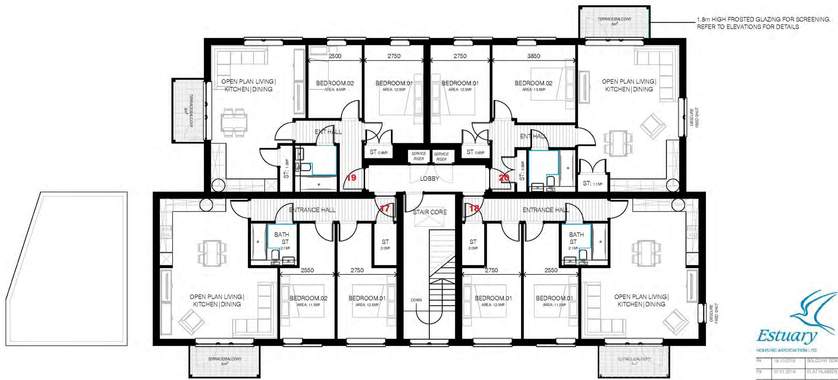
FLATS: PROPOSED SECOND FLOOR PLAN SCALE: 1:100@A1