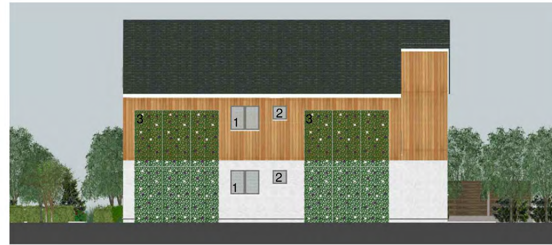
② Proposed Flats East Elevation With Landscaping