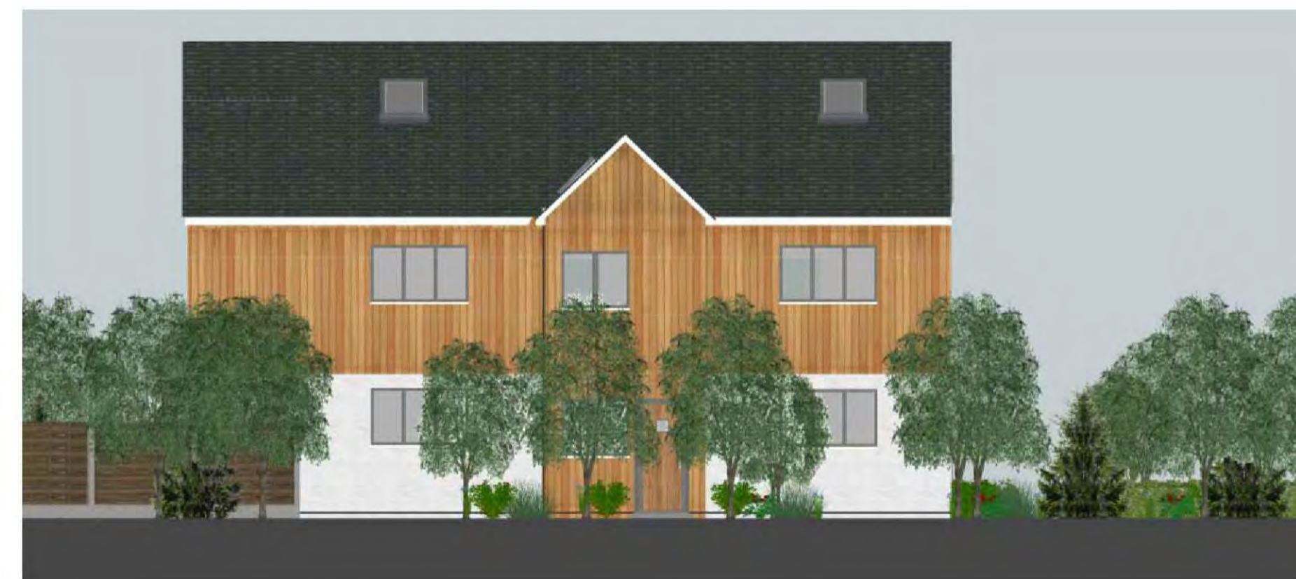
③ Proposed Flats West Elevation With Landscaping