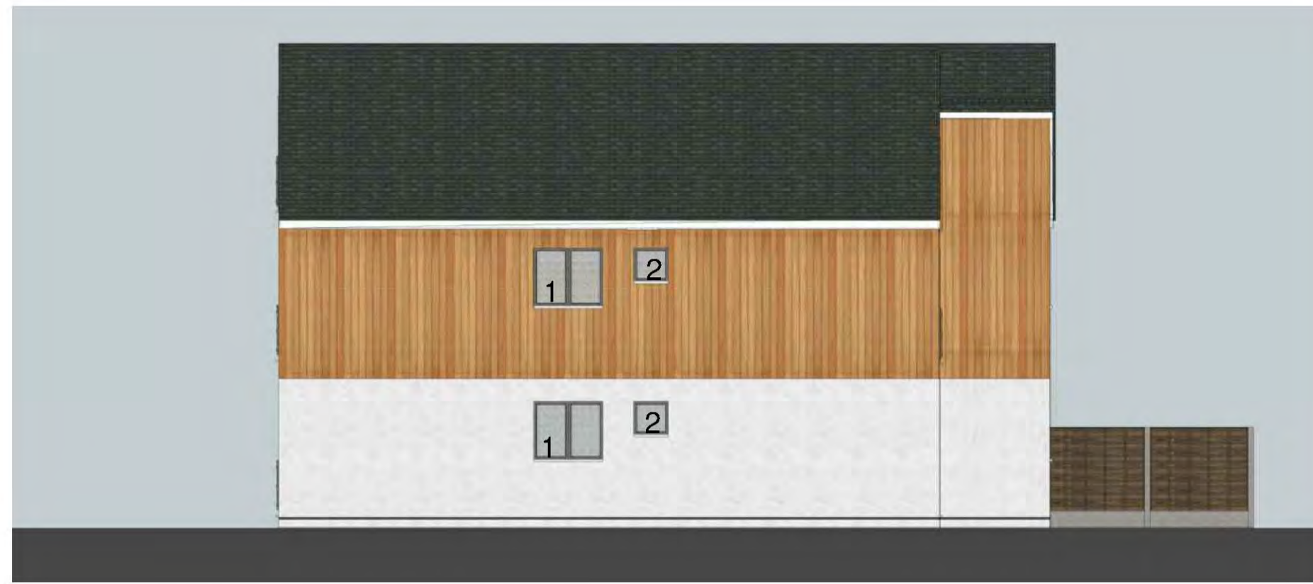
① Proposed Flats East Elevation