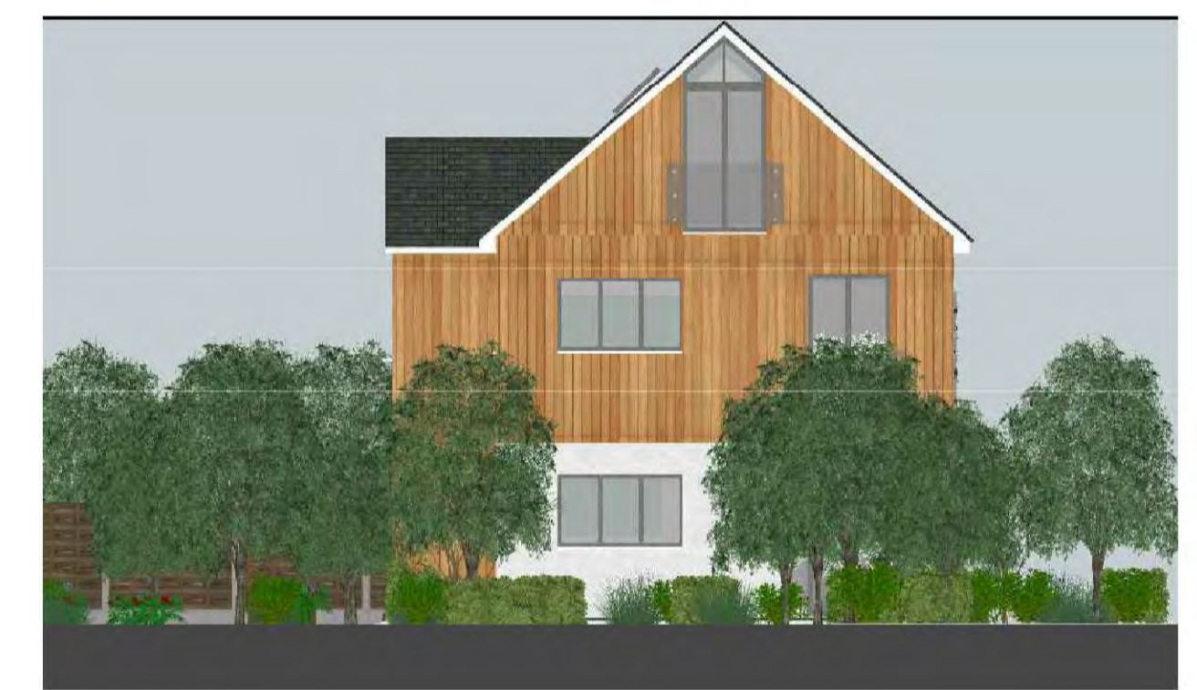
⑥ Proposed Flats South Elevation With Landscaping