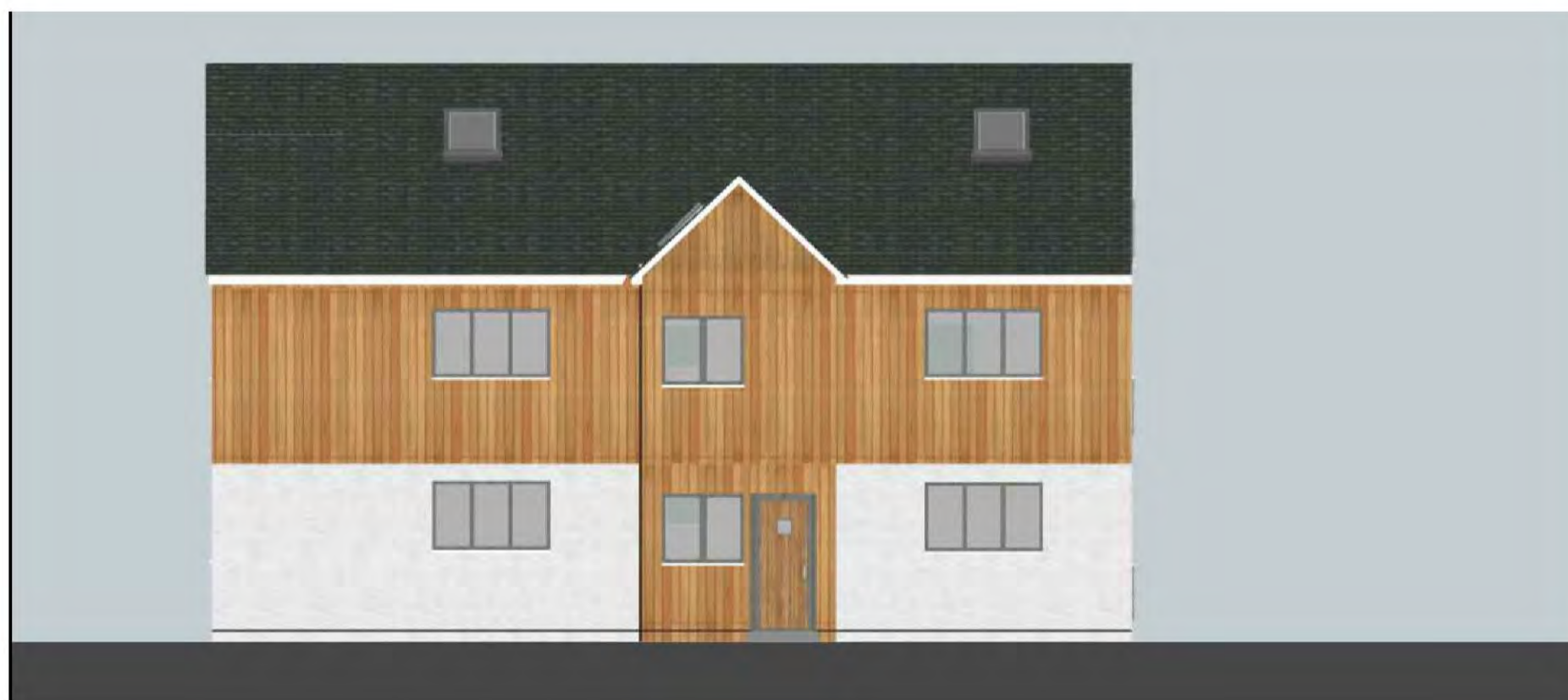
③ Proposed Flats West Elevation