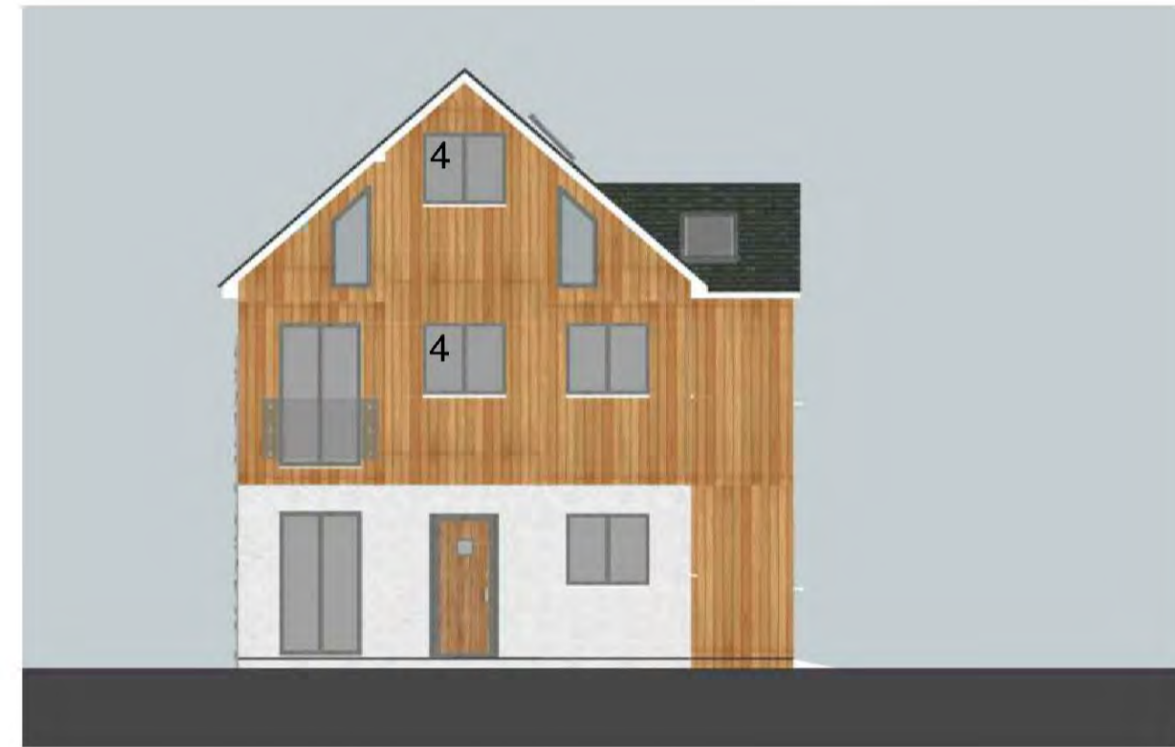
③ Proposed Flats North Elevation