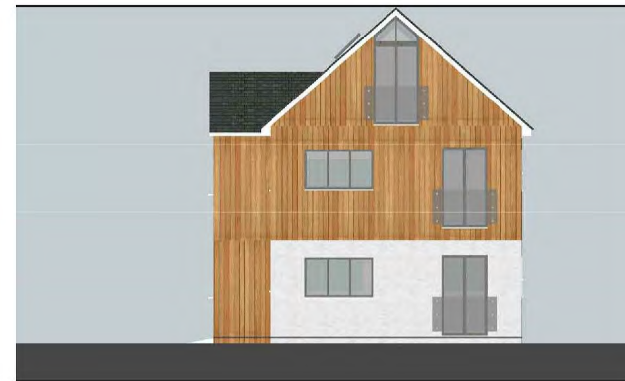
⑤ Proposed Flats South Elevation