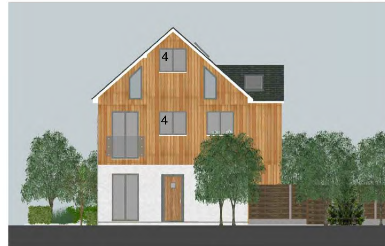
④ Proposed Flats North Elevation With Landscaping