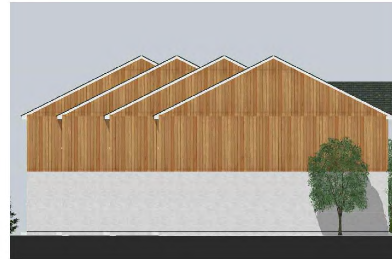
⑤ Proposed House South Elevation