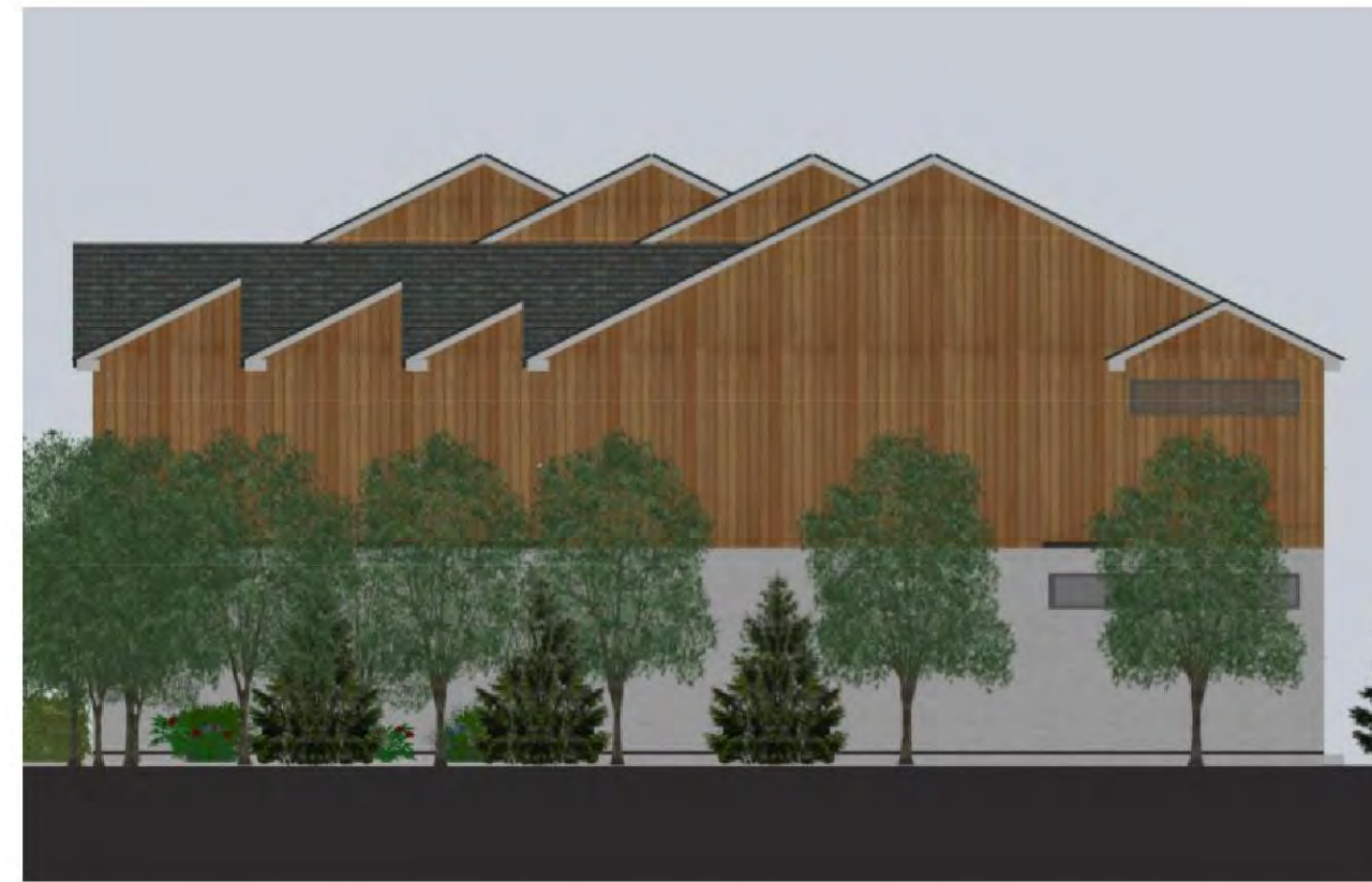
④ Proposed House North Elevation With Landscaping