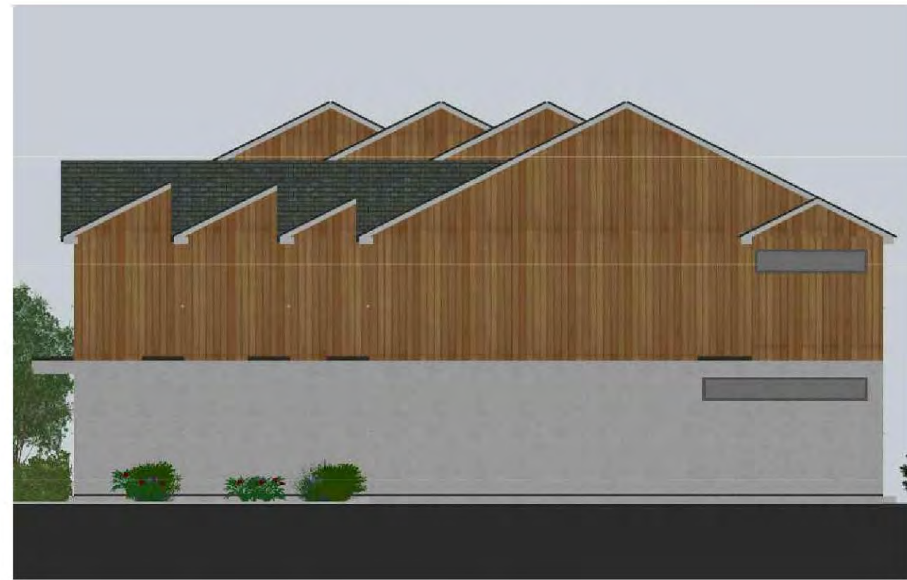
③ Proposed House North Elevation