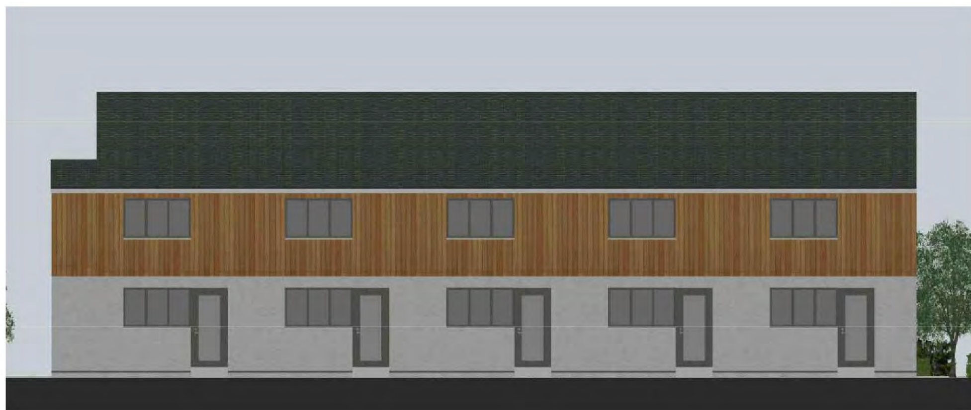
⑦ Proposed House West Elevation