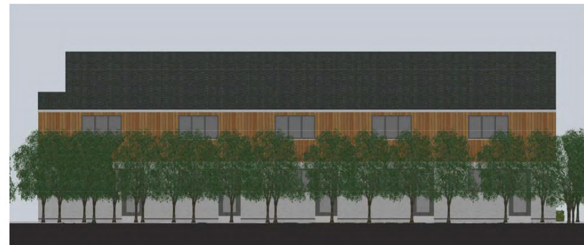
⑧ Proposed House West Elevation With Landscaping