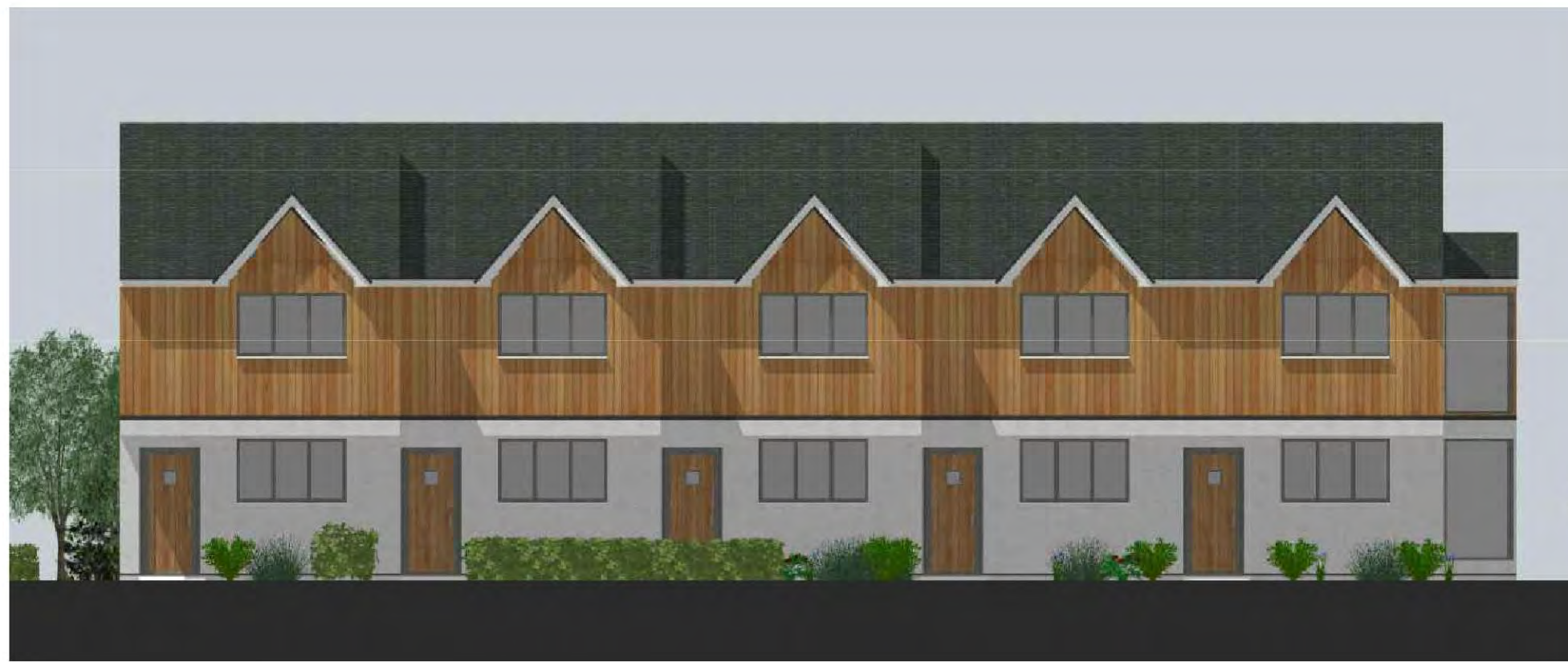
① Proposed House East Elevation