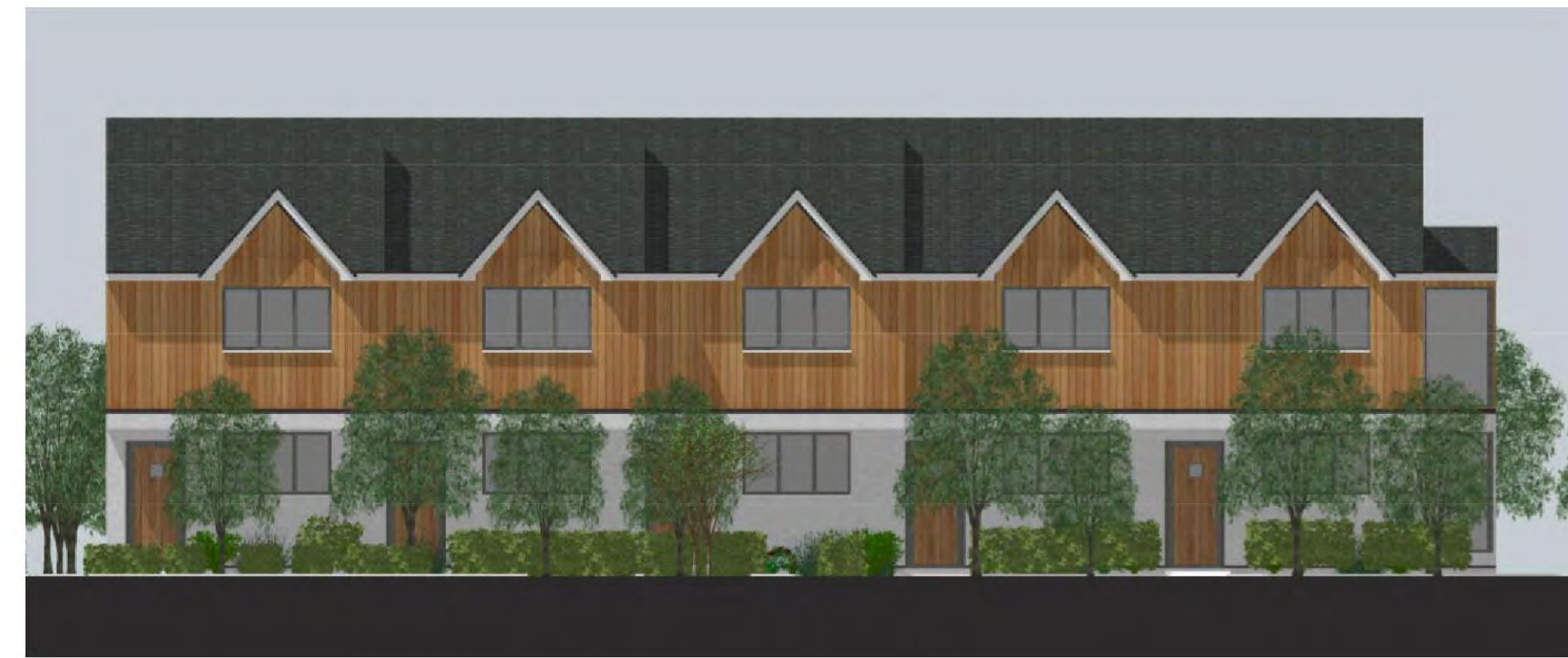
② Proposed House East Elevation With Landscaping