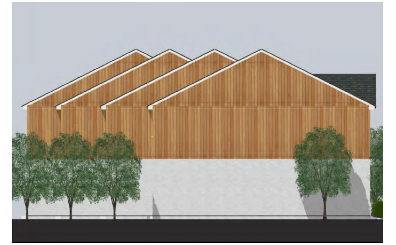
⑥ Proposed House South Elevation With Landscaping