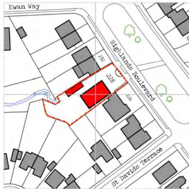
Location plan as existing scale 1:1250