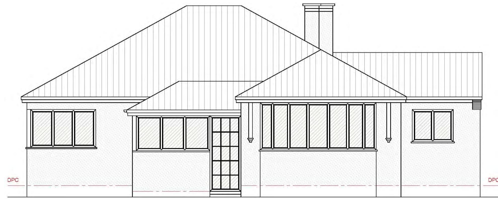
1 Existing Front Elevation 1:50

© This drawing is copyright and must not be reproduced without permission.