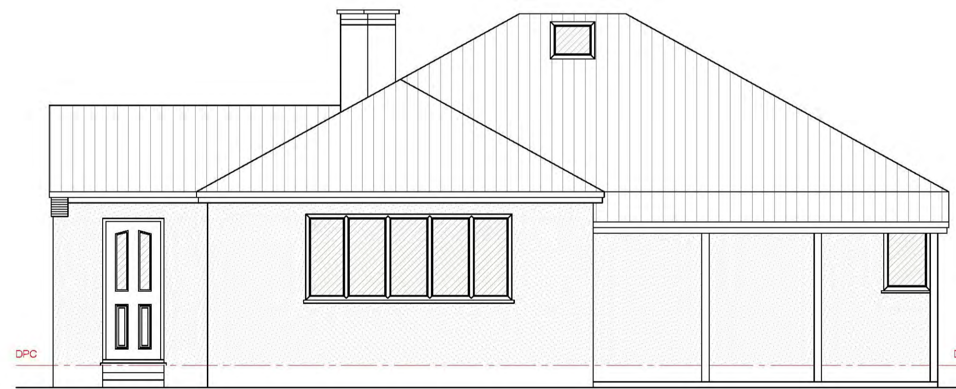
4 Existing Rear Elevation 1:50