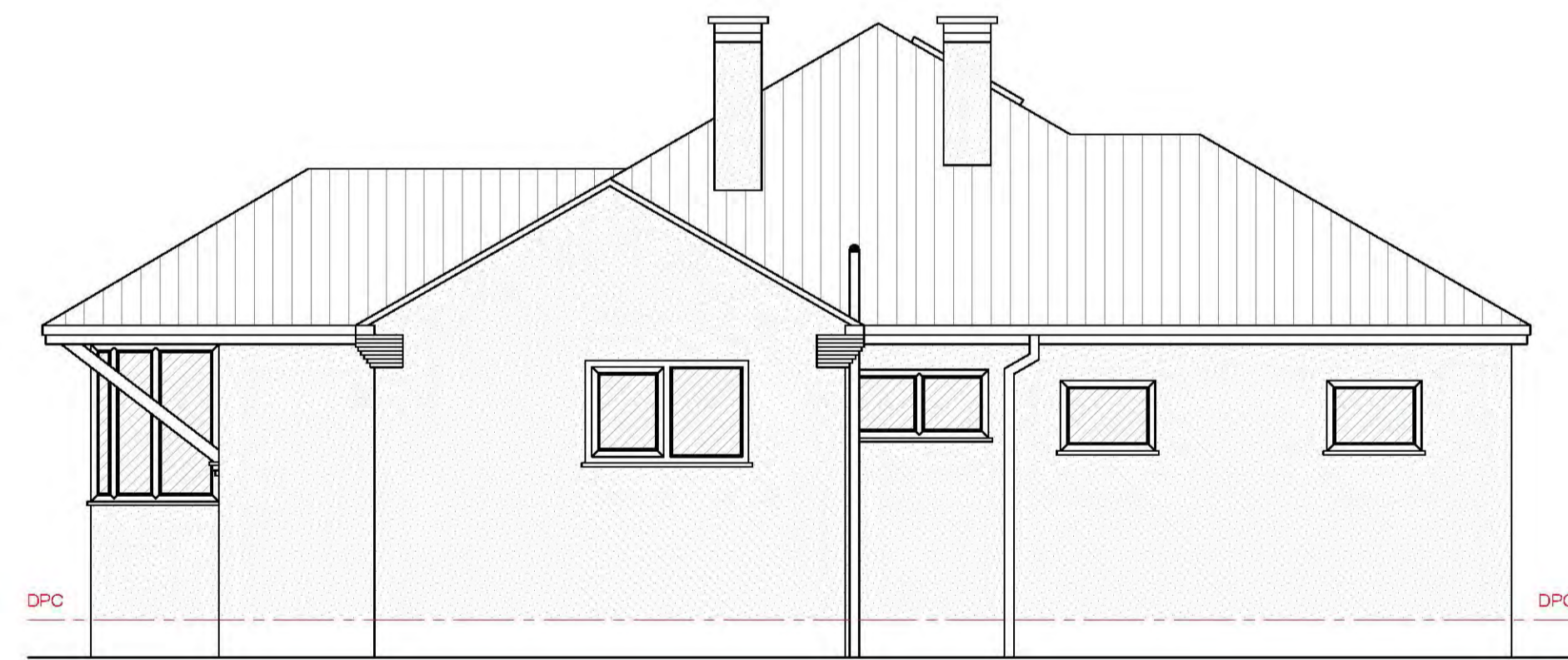
3 Existing Side Elevation 1:50