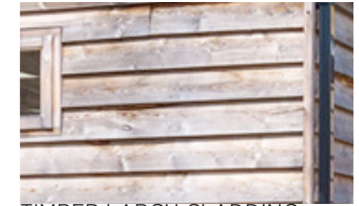
TIMBER LARCH CLADDING

The copyright in all designs, drawings, schedules, specifications and any other documentation prepared by DAP Architecture Ltd. in relation to this project shall remain the property of DAP Architecture Ltd. and must not be reissued, loaned or copied without prior written consent.