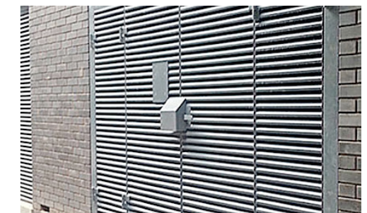
METAL BI-FOLD DOORS