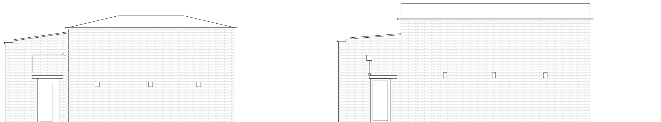
Existing North East Facing Elevation 1:100 @ A3