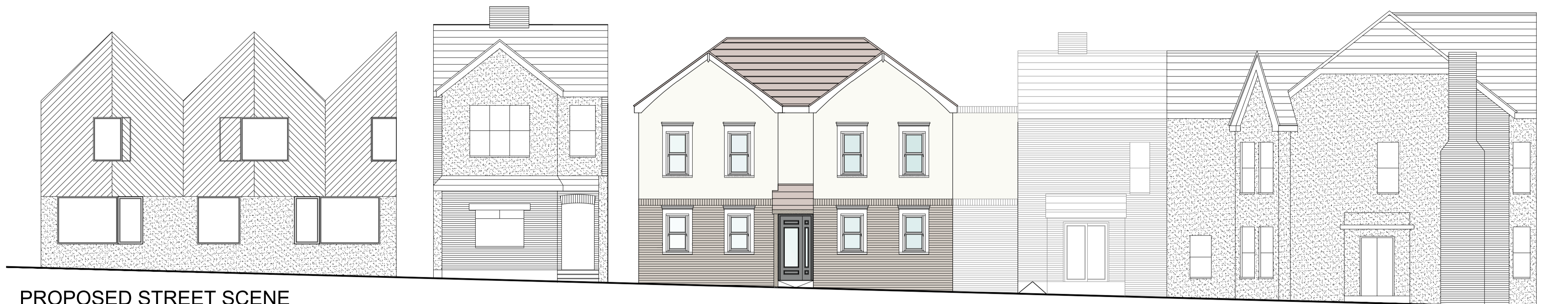
PROPOSED STREET SCENE Scale 1:100

The contractor is to check and verify all building and site dimensions, levels, and sewer invert levels at connection points before work starts. This drawing must be read with and checked against any structural or other specialist drawings provided. Any discrepancies found on this drawing are to be notified to STONE MEI DESIGN LTD prior to commencement of work. The contractor is to comply in all respects with the current Building Regulations whether or not specifically stated on these drawings. This drawing is not intended to show details of foundations or ground conditions. Each area of ground relied upon to support the structure depicted must be investigated by the contractor and suitable methods of foundations provided. This drawing is to be read in conjunction with all other standard STONE MEI DESIGN LTD specifications and documentation. STONE MEI DESIGN LTD reserves the right to withdraw any drawings from any applications or third parties should disputes arise between the client and STONE MEI DESIGN LTD. This drawing remains the copyright of STONE MEI DESIGN LTD and cannot be reproduced without prior permission.