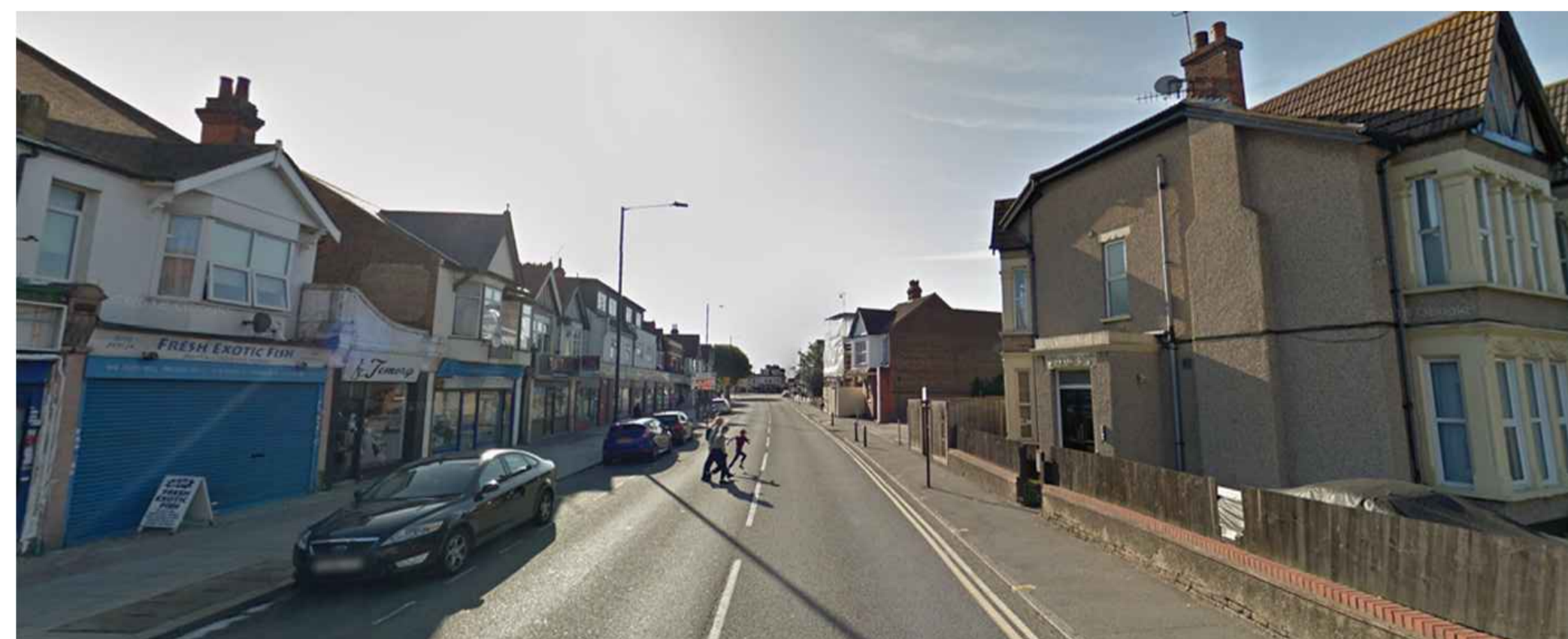
EXISTING STREET SCENE