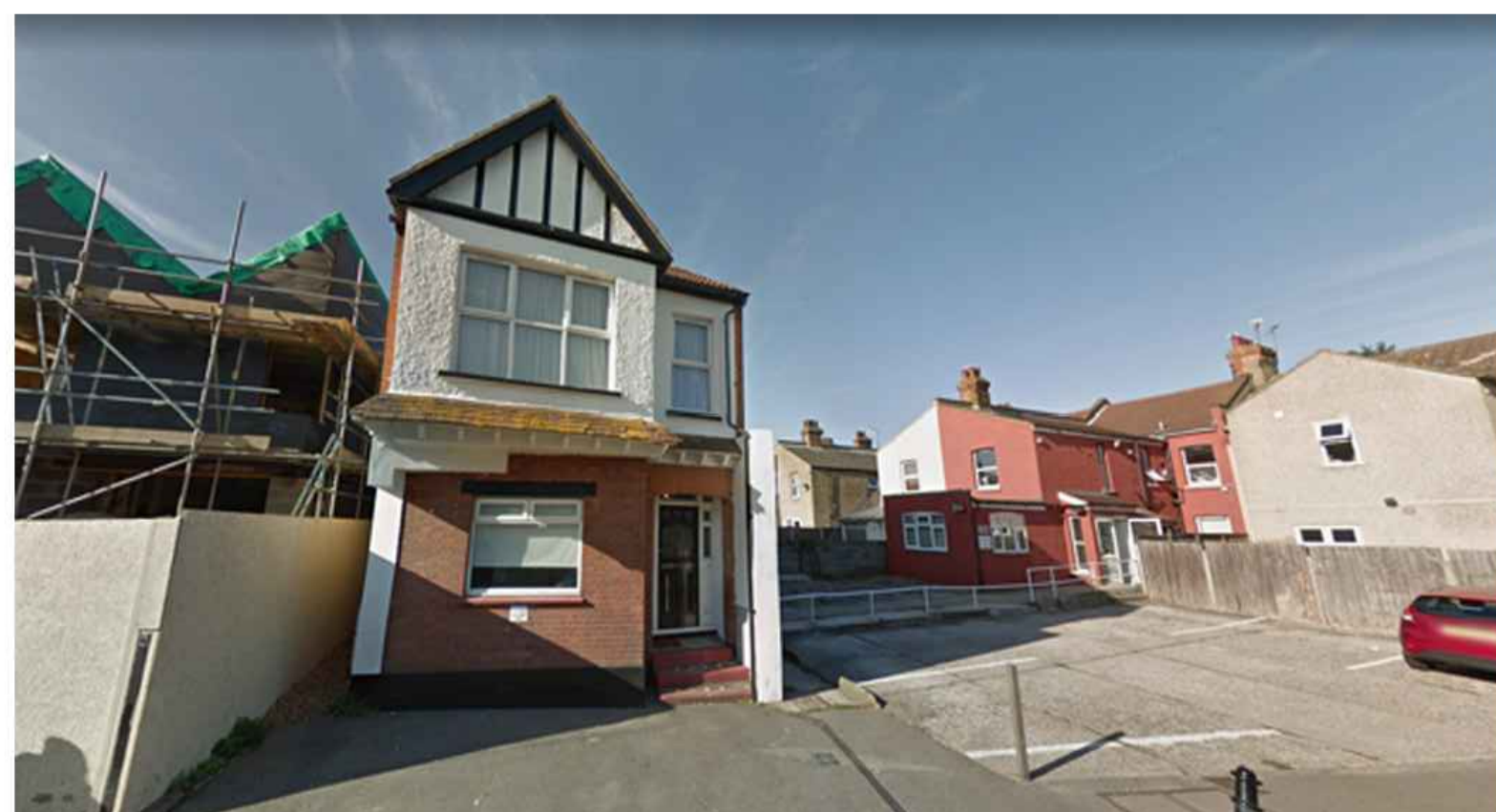
EXISTING STREET SCENE