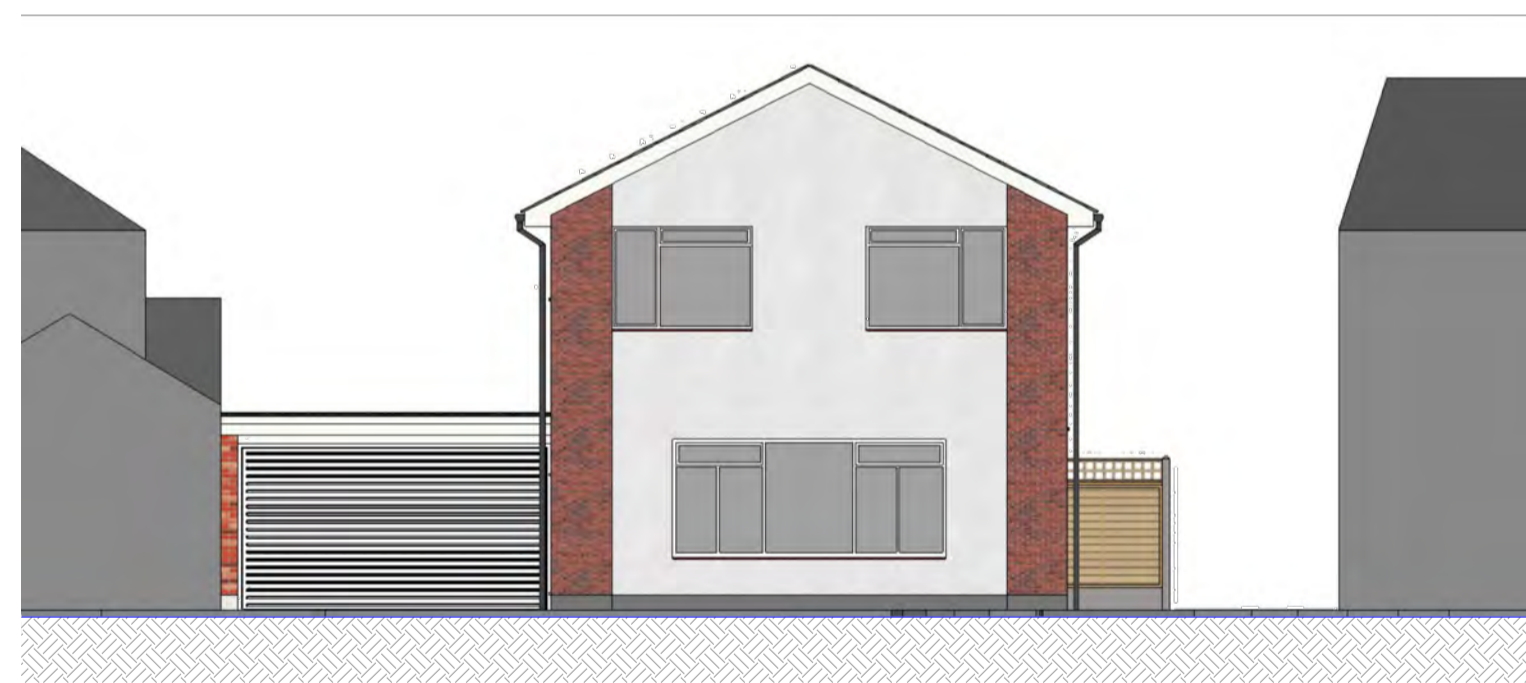
4 Existing Front Elevation