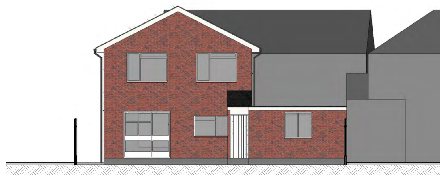
6 Existing Rear Elevation