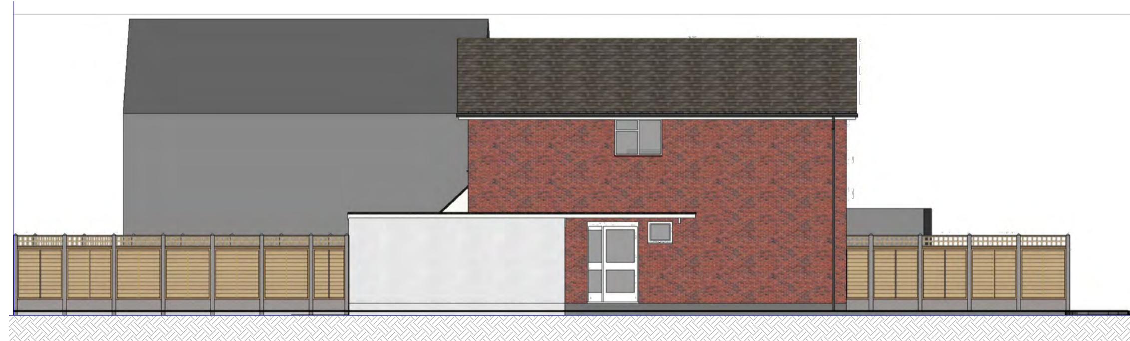
5 Existing Left Elevation