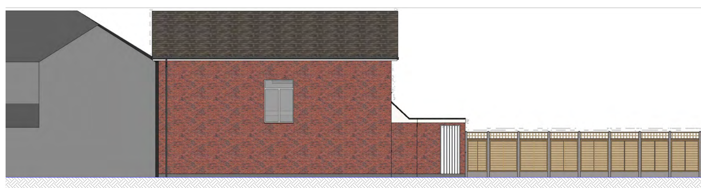
7 Existing Right Elevation