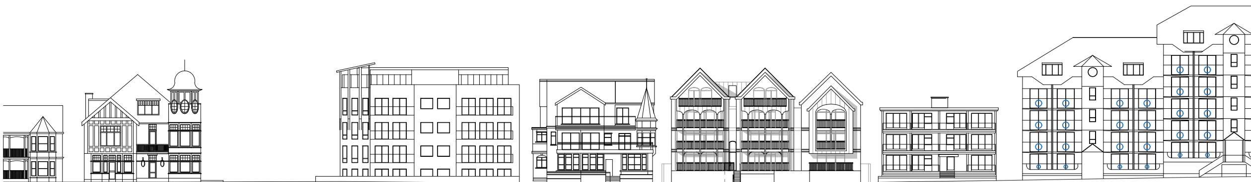
PROPOSED STREET ELEVATION 1:500 @ A3