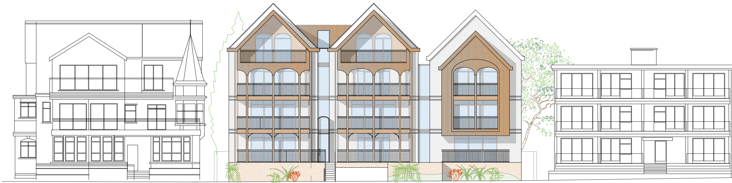
PROPOSED FRONT ELEVATION 1:200 @ A3