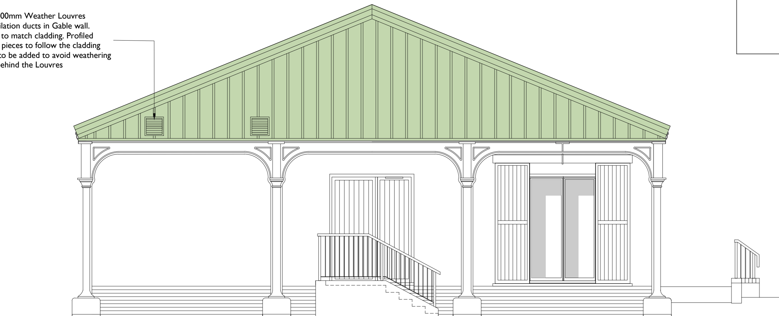
SOUTH (END) ELEVATION

400 x 400mm Weather Louvres to ventilation ducts in Gable wall. Colour to match cladding. Profiled Packing pieces to follow the cladding profile to be added to avoid weathering issues behind the Louvres