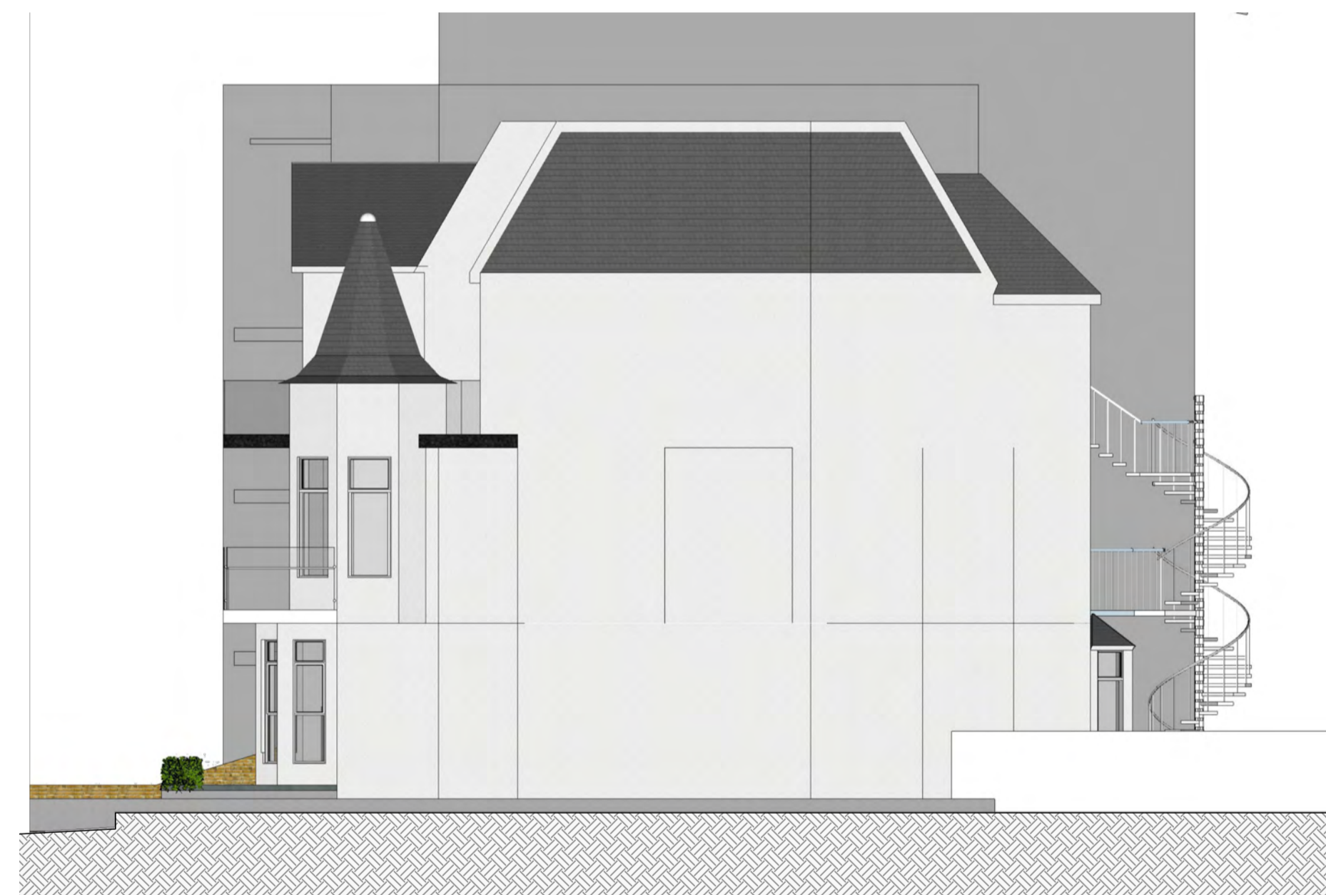
④ Existing Right Elevation