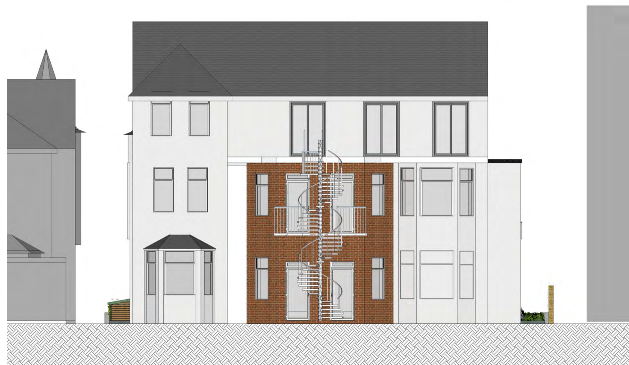
③ Existing Rear Elevation