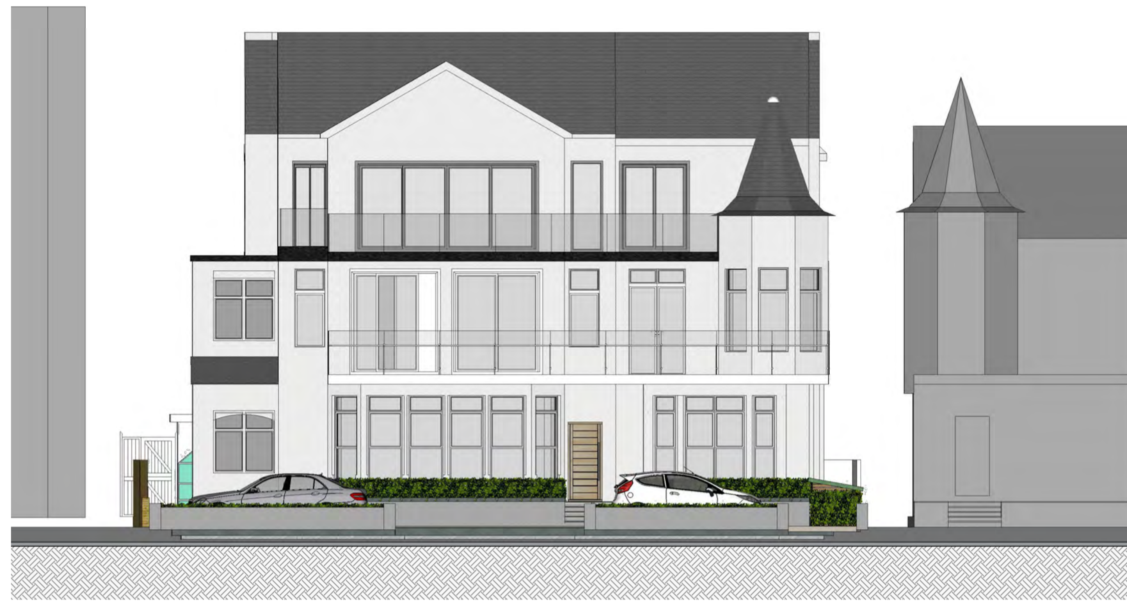
① Existing Front Elevation