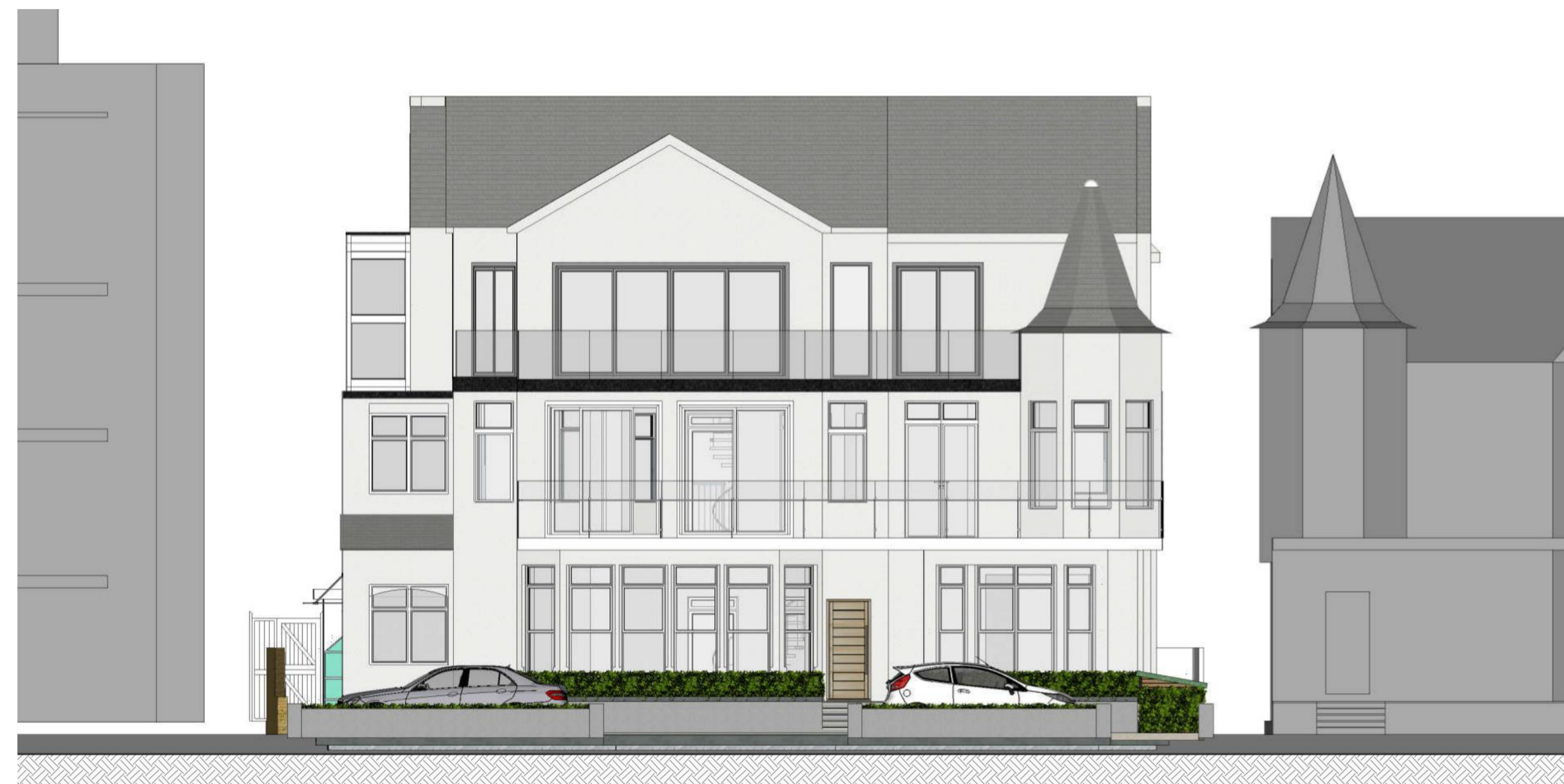
1 Proposed Front Elevation