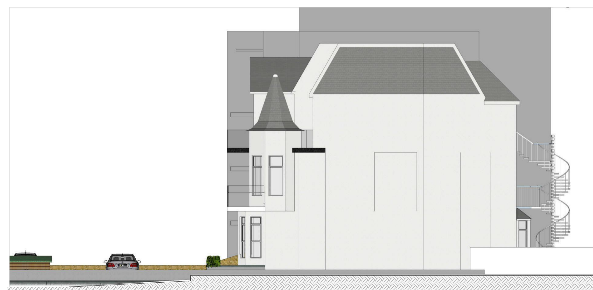
4 Proposed Right Elevation