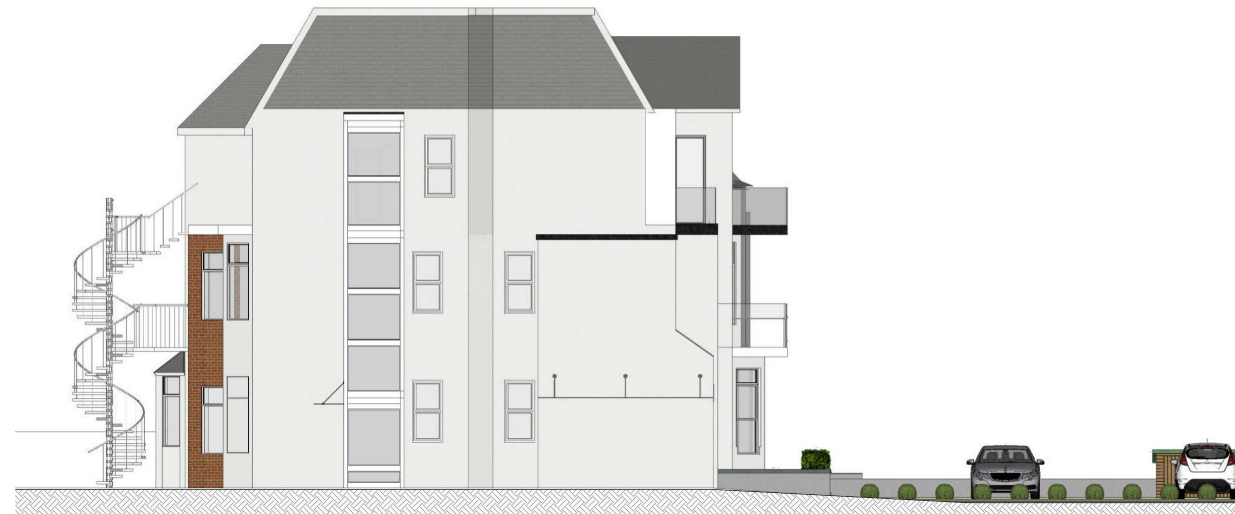
2 Proposed Left Elevation