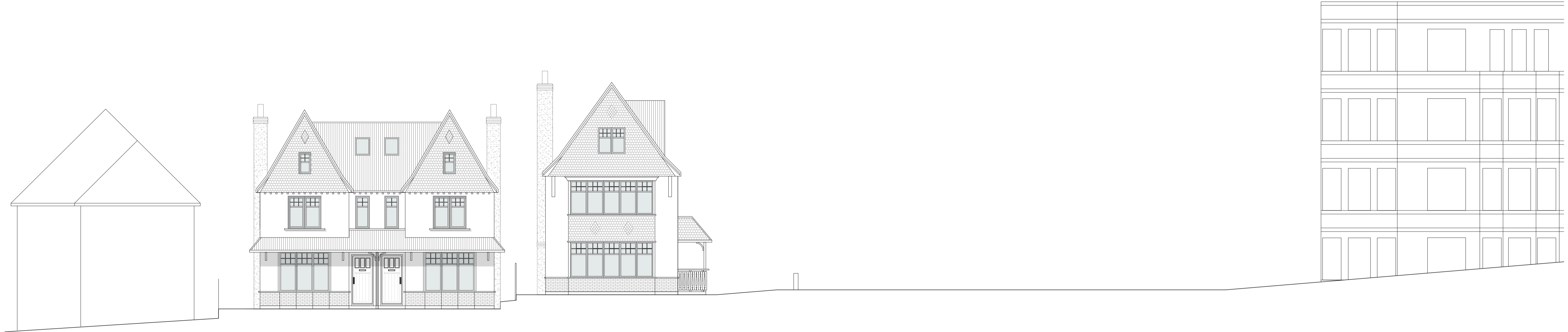
INDICATIVE STREETSCENE 1:100 0 1 2 3 4 5