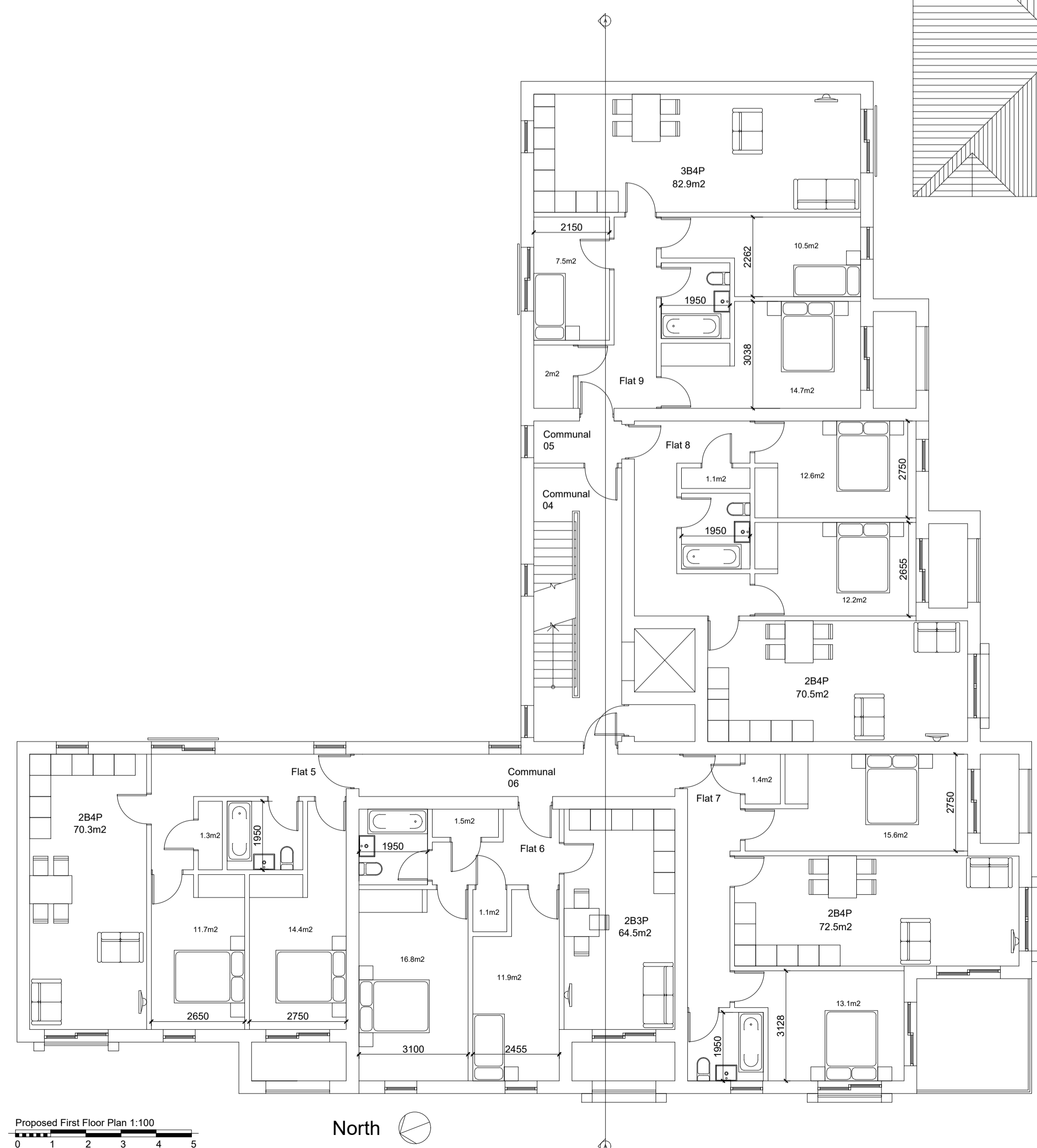
Proposed First Floor Plan 1:100