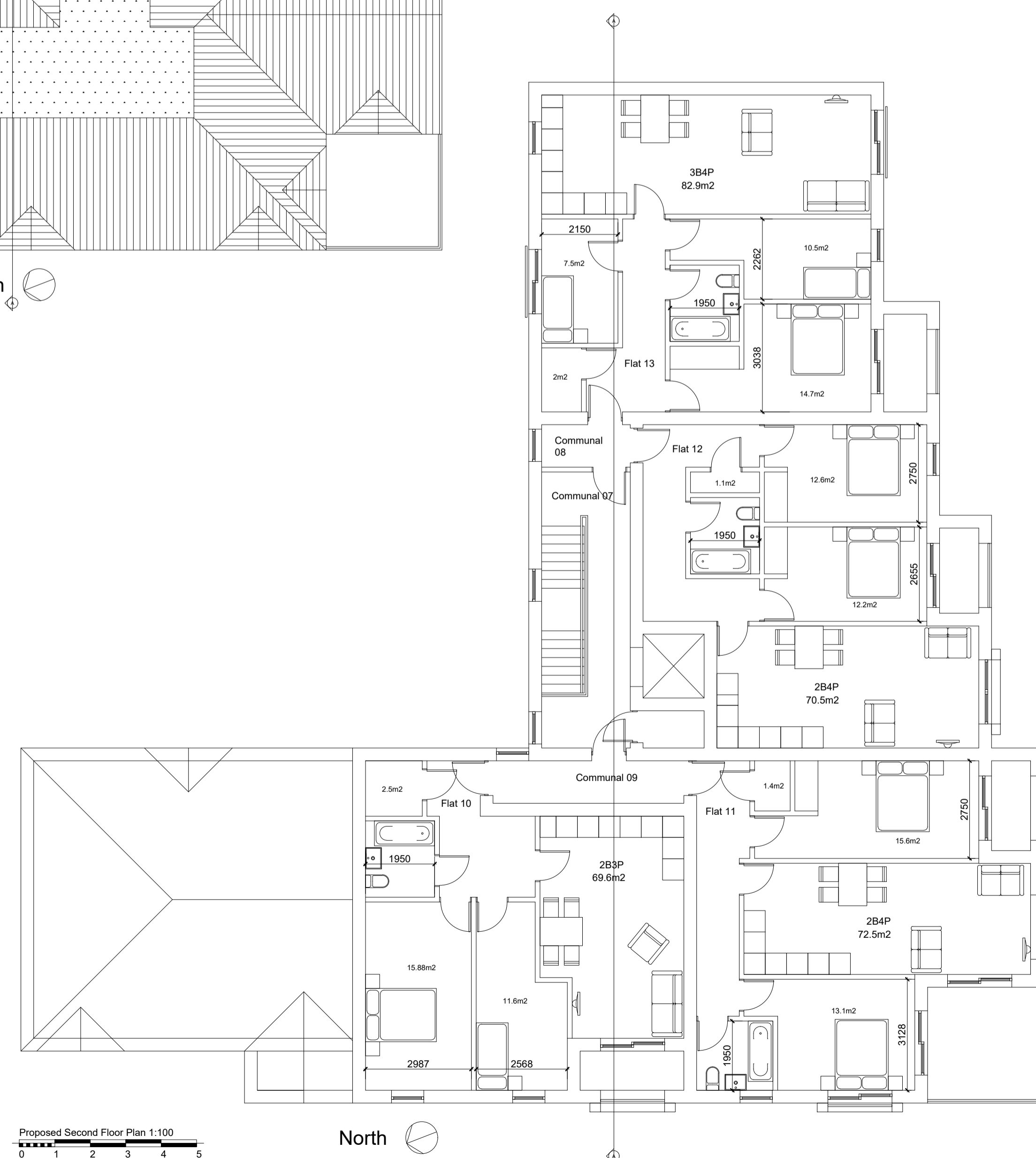
Proposed Second Floor Plan 1:100