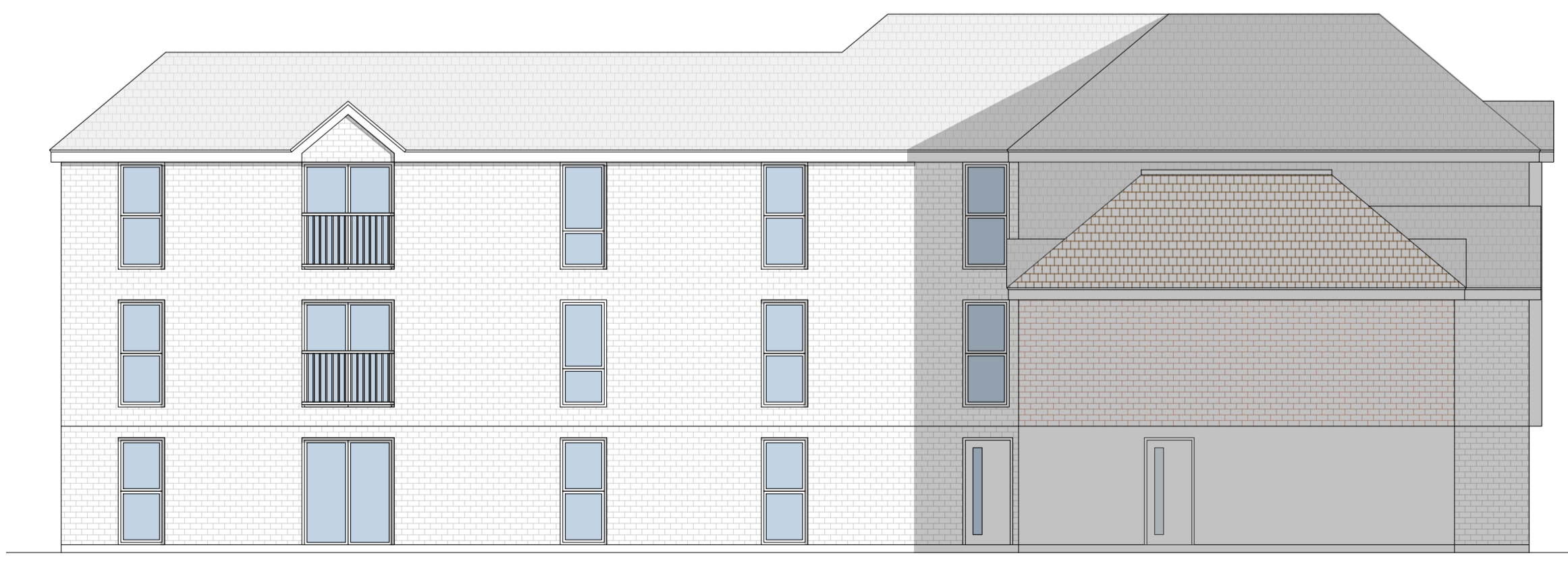
Proposed North Elevation 1:100