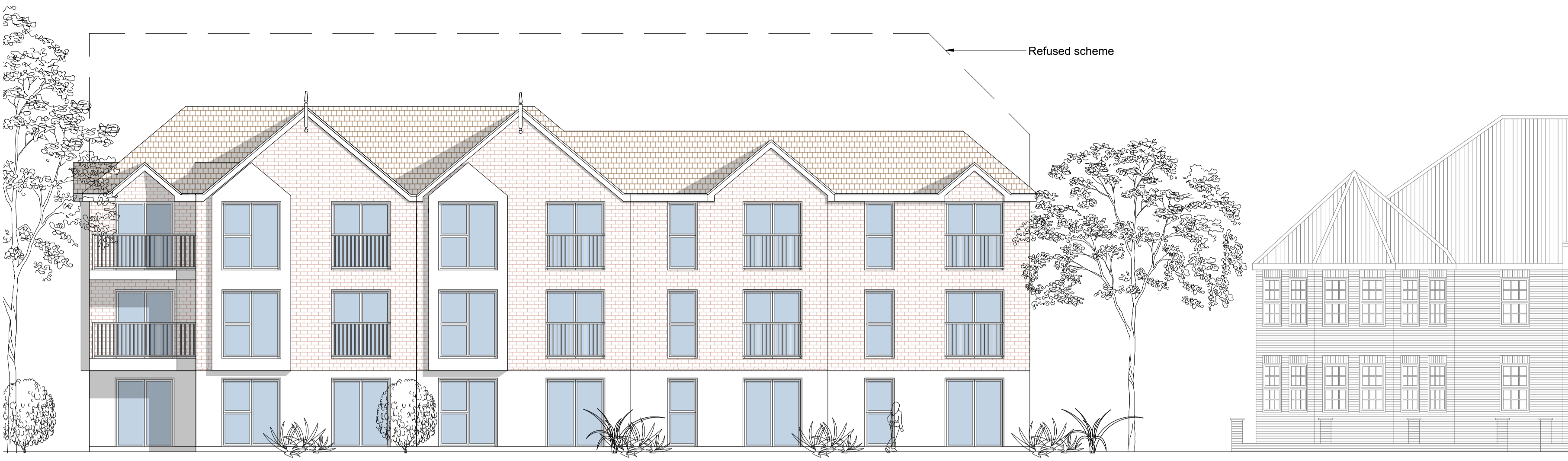
Proposed South Elevation 1:100