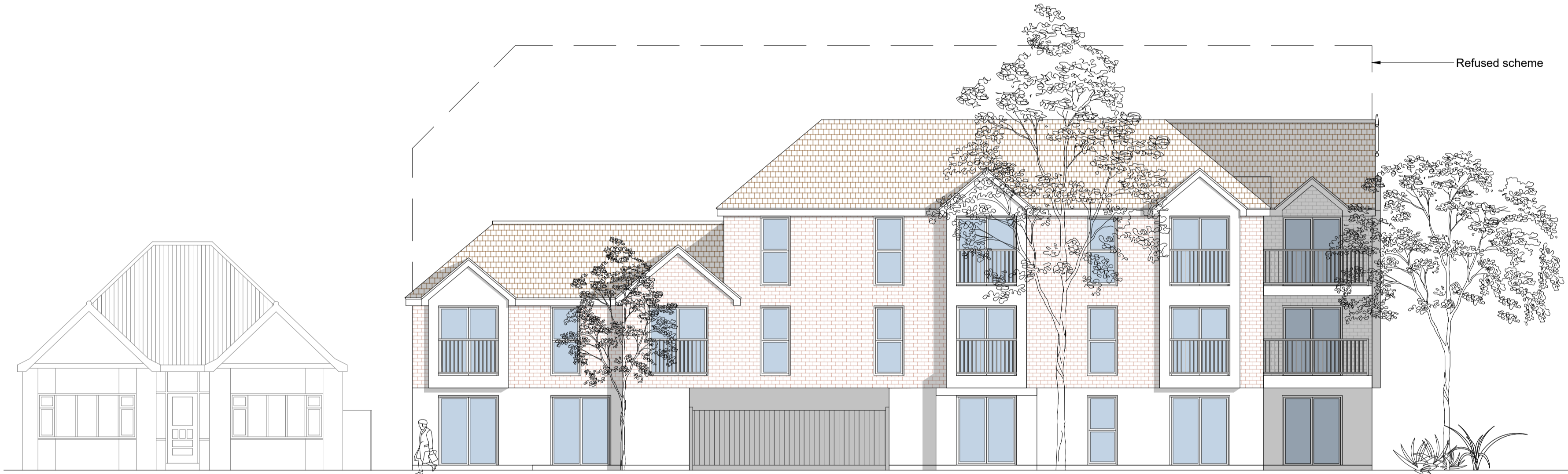
Proposed West Elevation 1:100