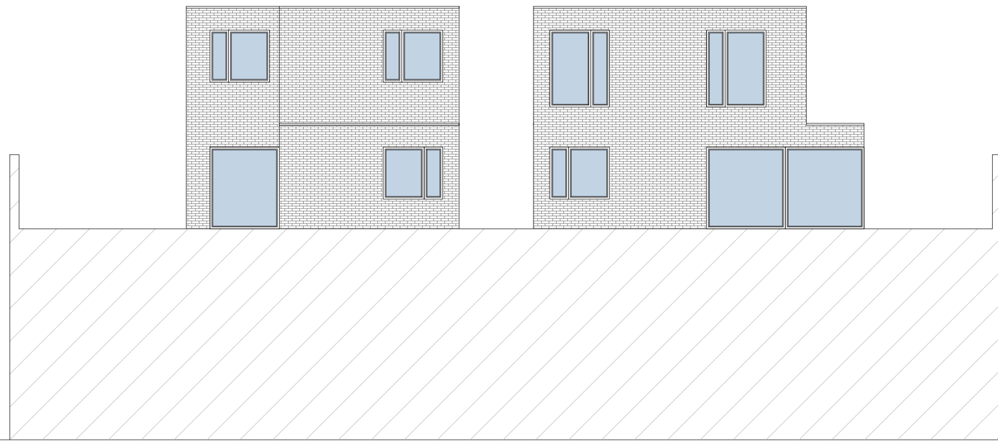
Proposed Rear Elevation 1:100 0 1 2 3 4 5