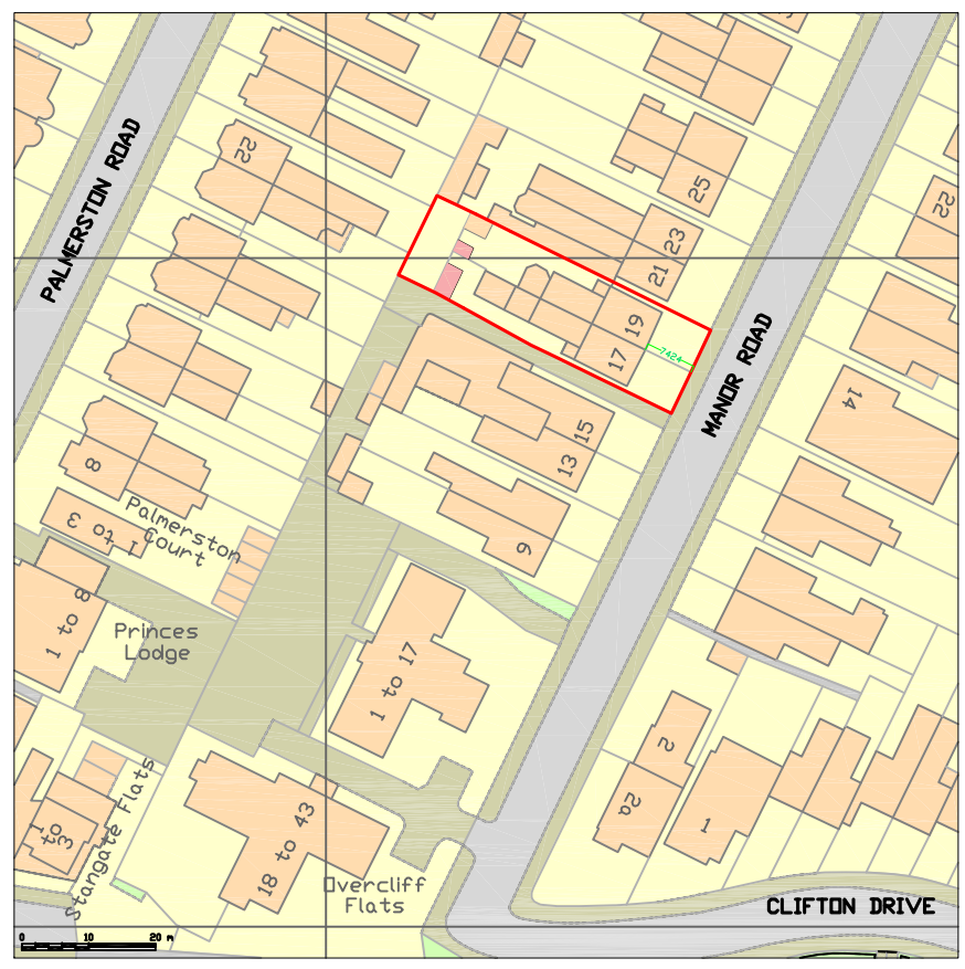
SITE LOCATION PLAN Scale: 1:1250