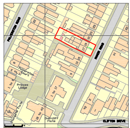
SITE PLAN Scale: 1:2500