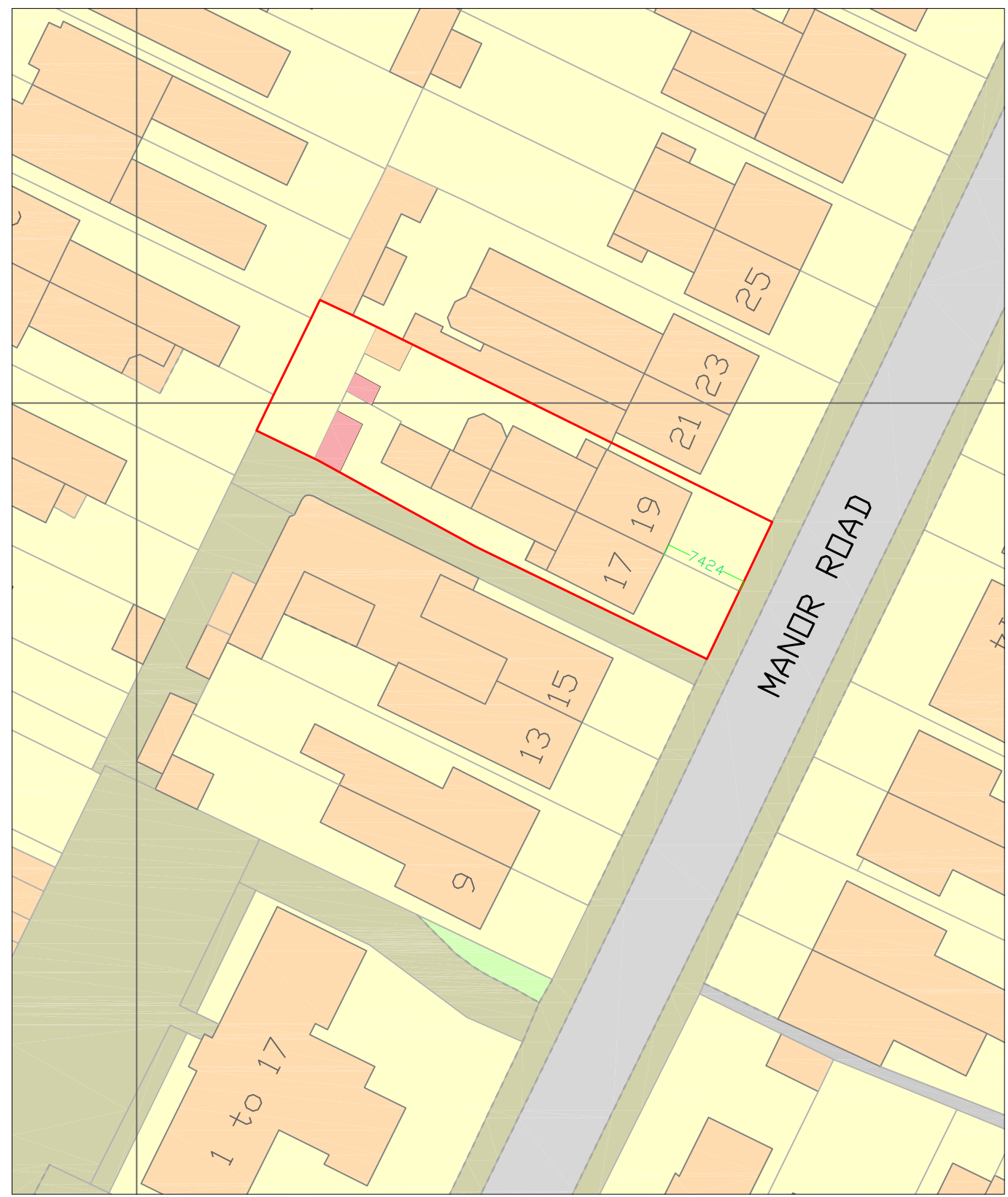
BLOCK PLAN Scale: 1:500

PROJECT NO. 2001 - DRG NO. 105 - REV. P3