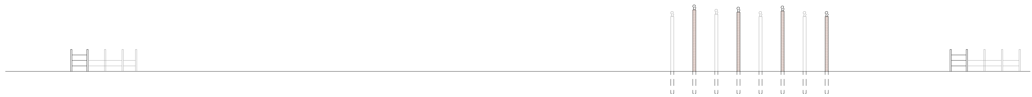
Proposed North East Elevation (View from the beach) 1:100 @ A1