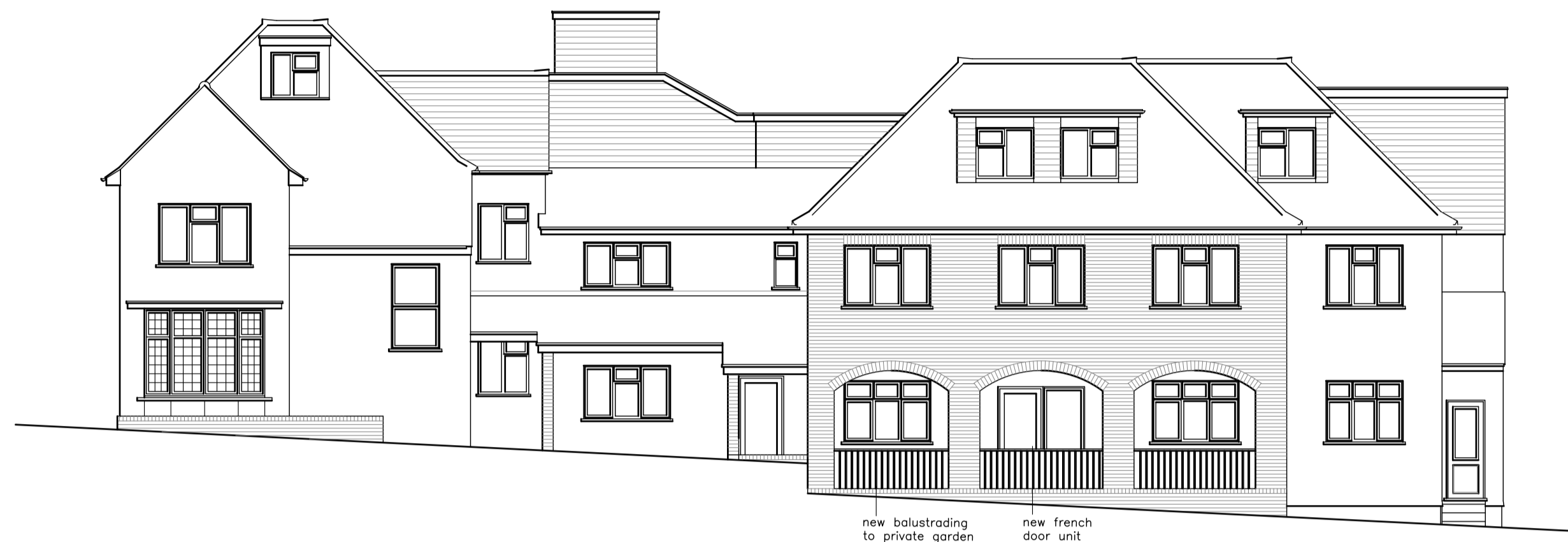
front elevation scale 1:100