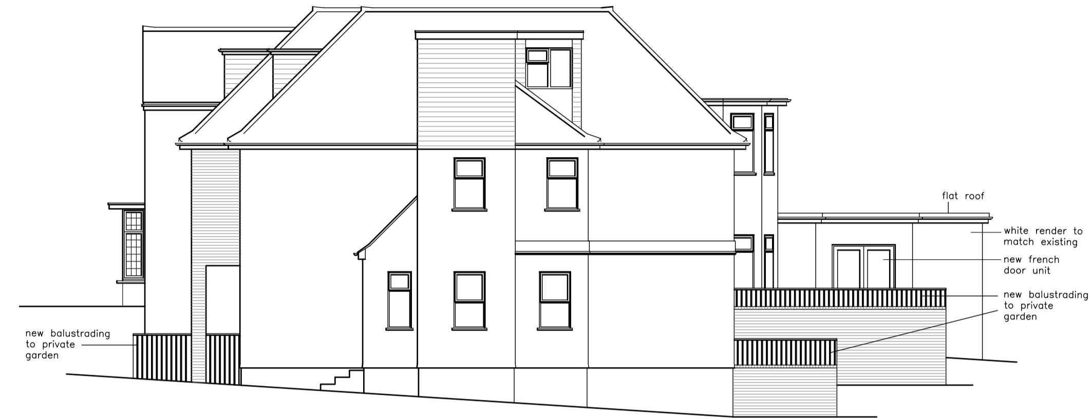
side elevation scale 1:100