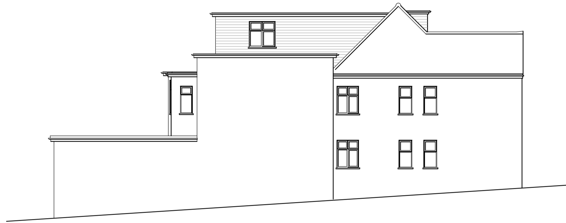
side elevation scale 1:100