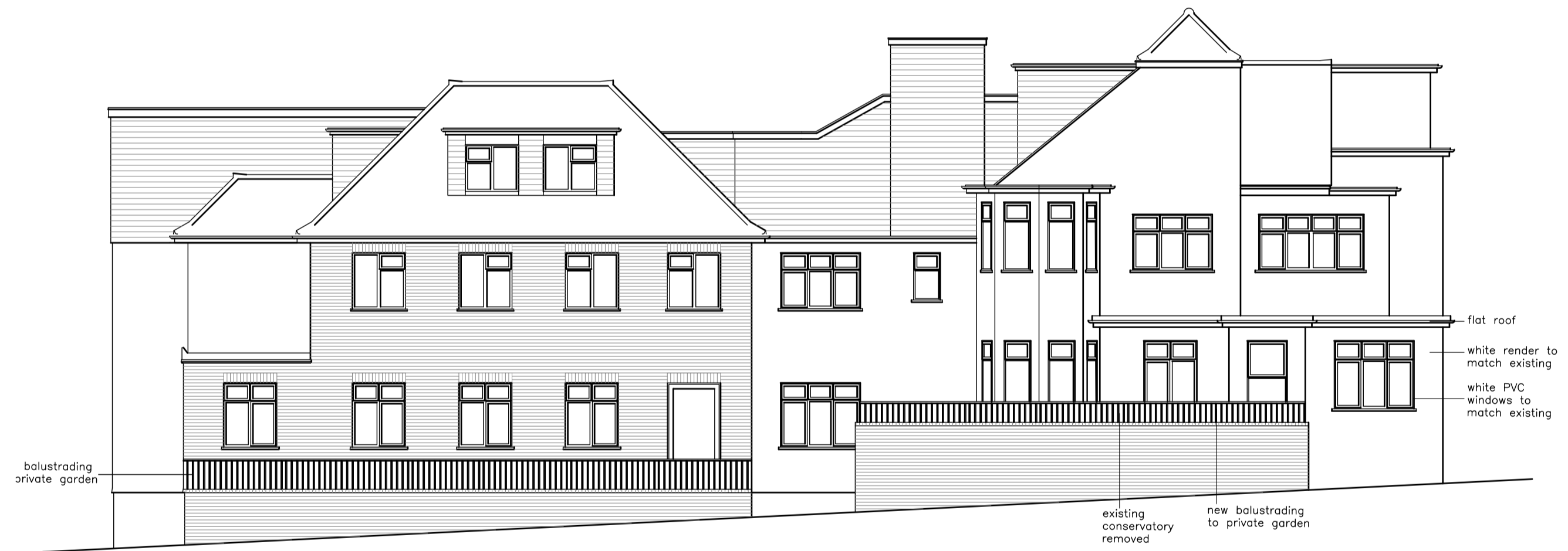
rear elevation scale 1:100