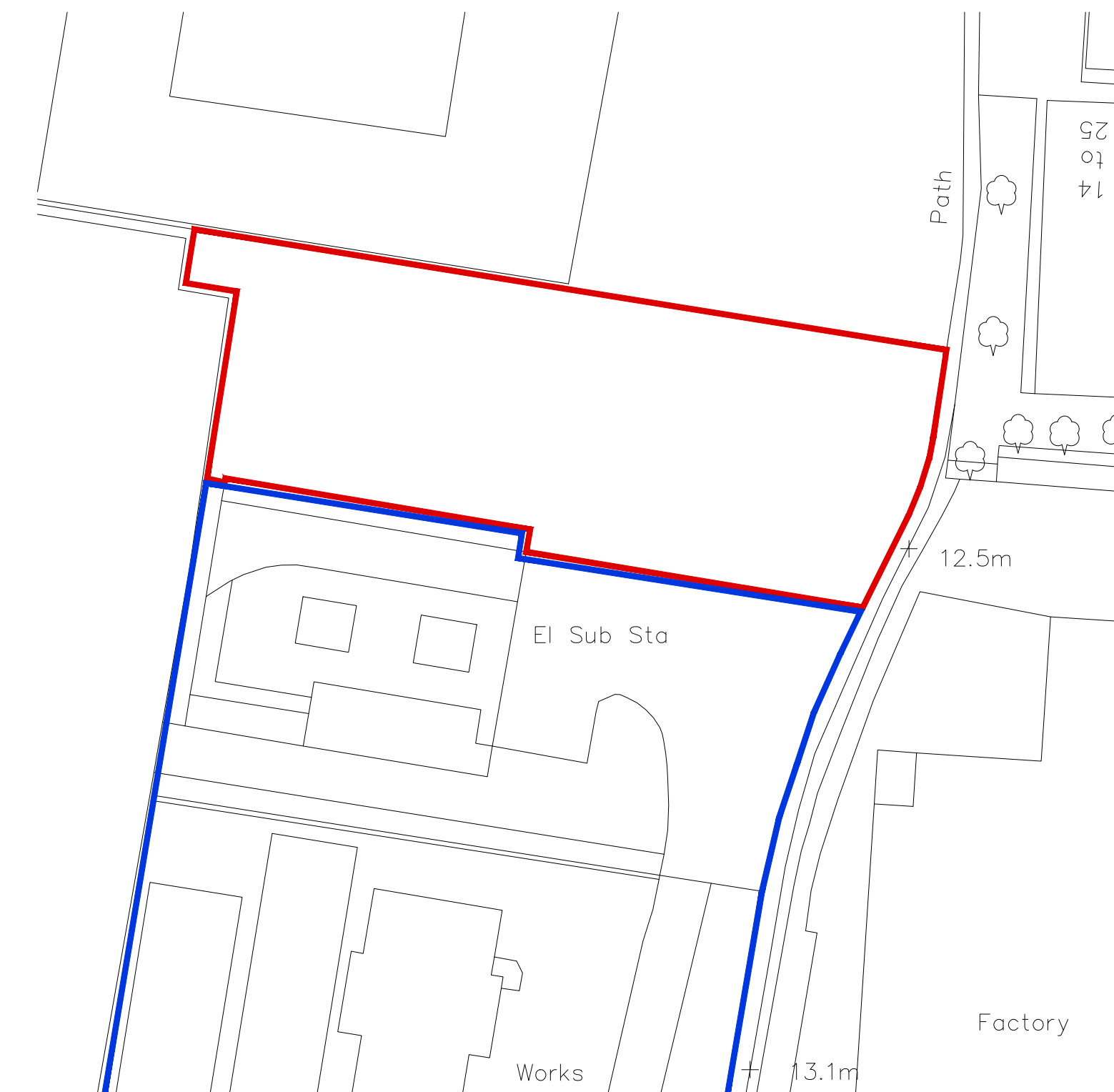
Existing Block Plan 1:500