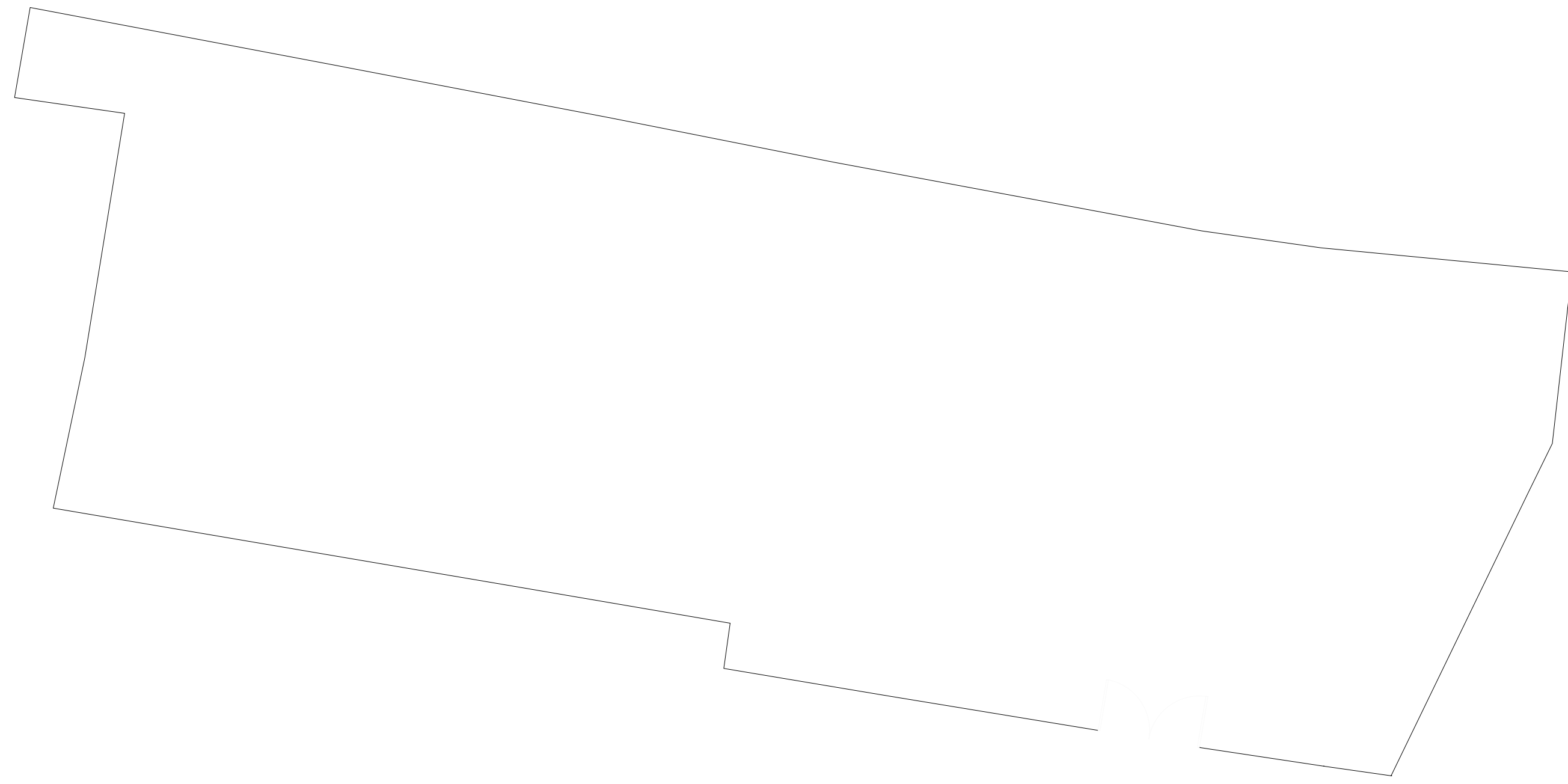
Existing Site Plan 1:200