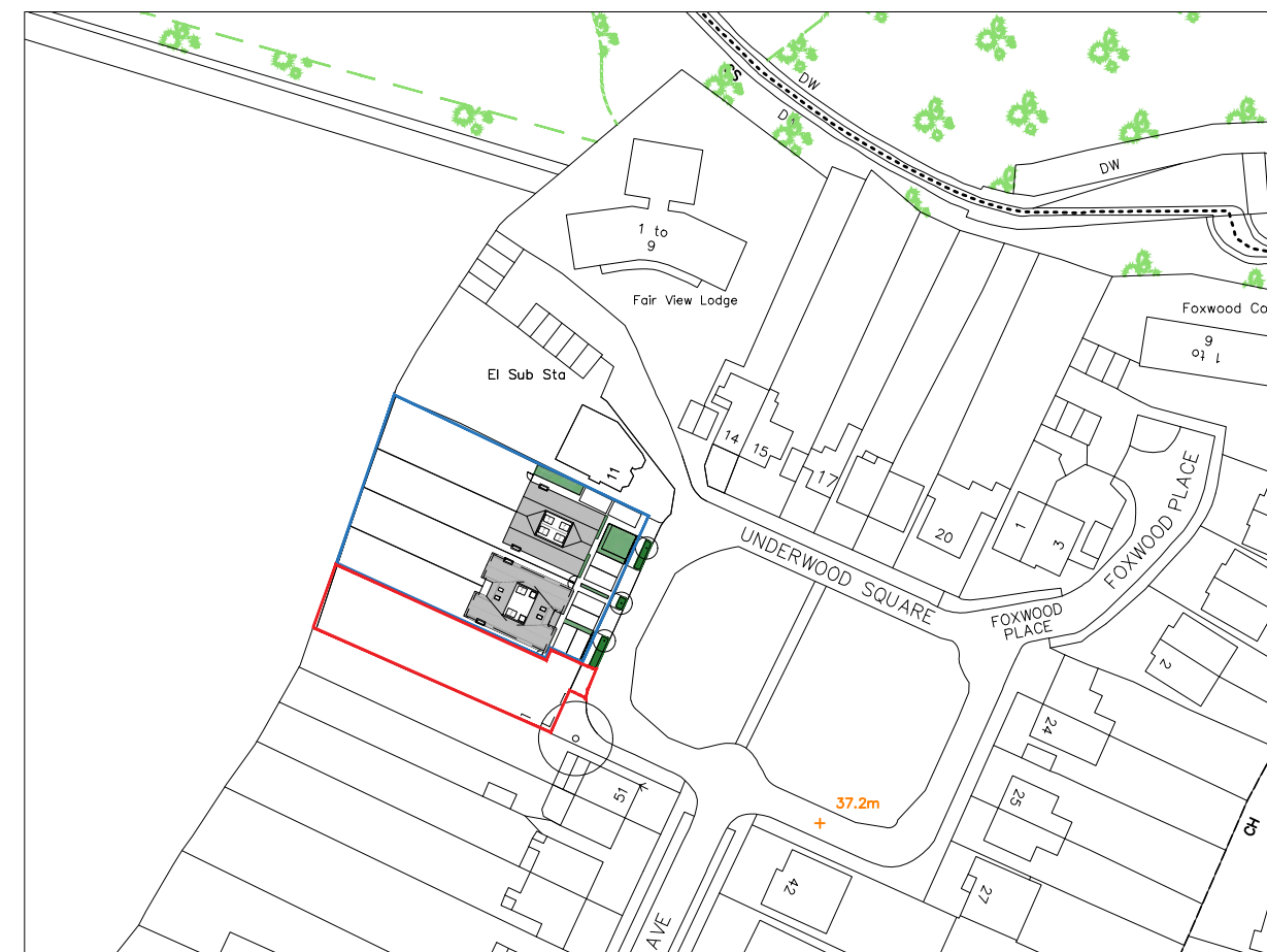
2020 CONSENT - LOCATION PLAN - 1:1250 0 25 50 75 100 125