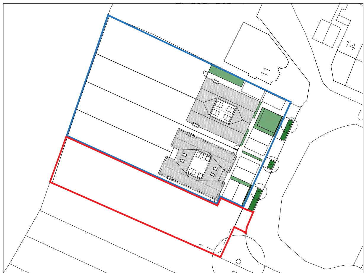
2020 CONSENT - BLOCK PLAN - 1:500 0 10 20 30 40 50