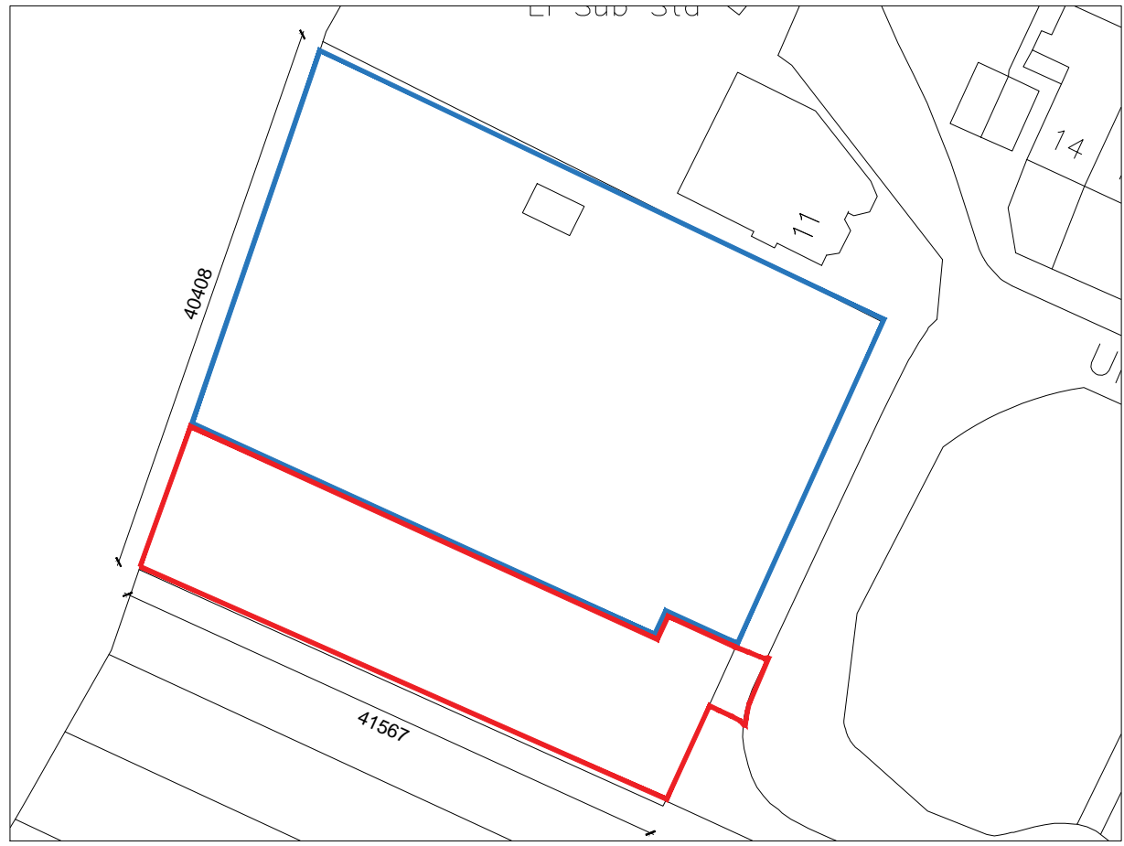
EXISTING BLOCK PLAN - 1:500 0 10 20 30 40 50