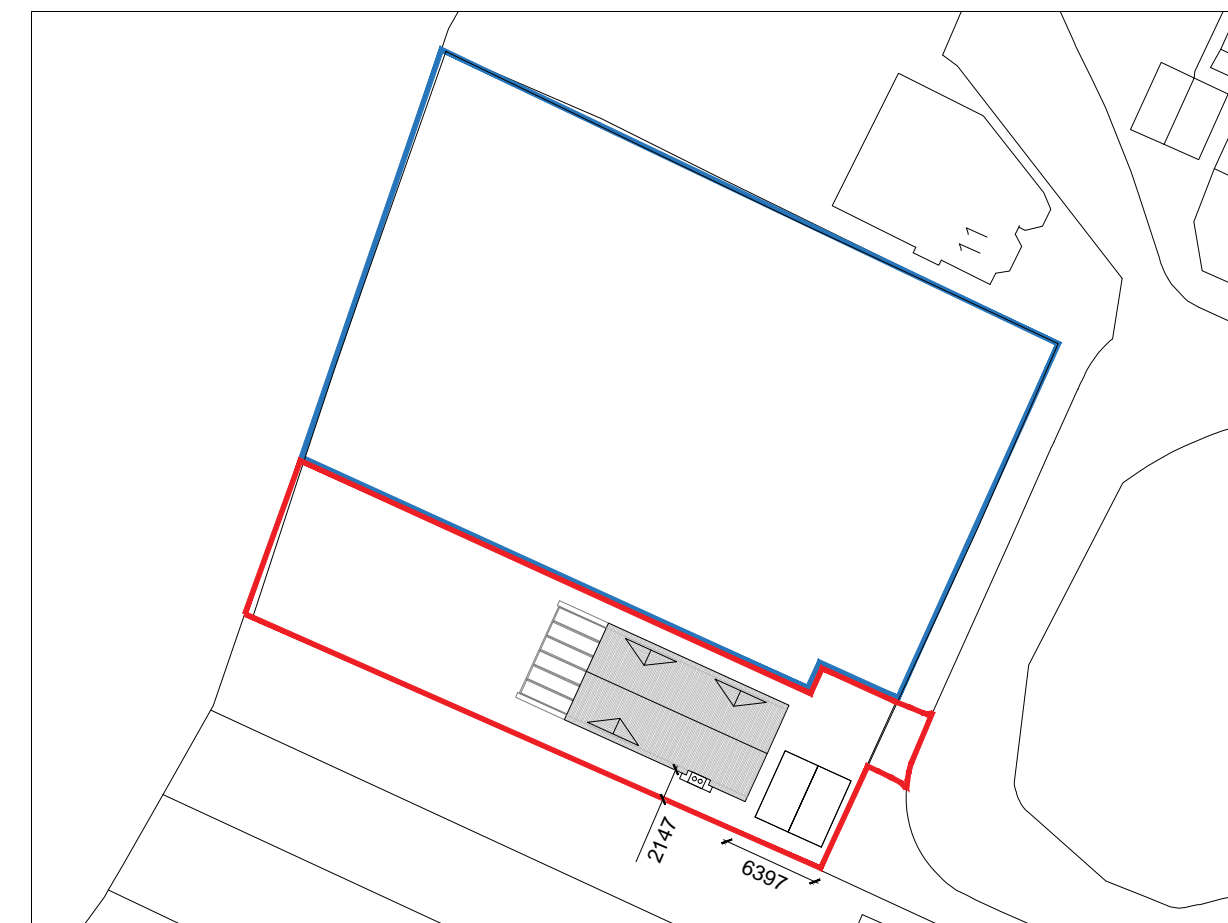
PROPOSED BLOCK PLAN - 1:500 0 10 20 30 40 50