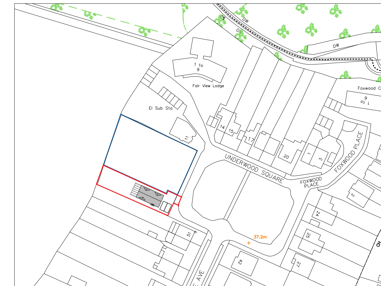
PROPOSED SITE PLAN - 1:1250 0 25 50 75 100 125

PLANNING REFERENCE: 19/02289/FUL DATED 4TH MARCH 2020