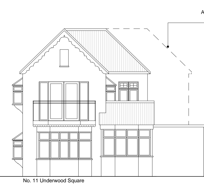
No. 11 Underwood Square