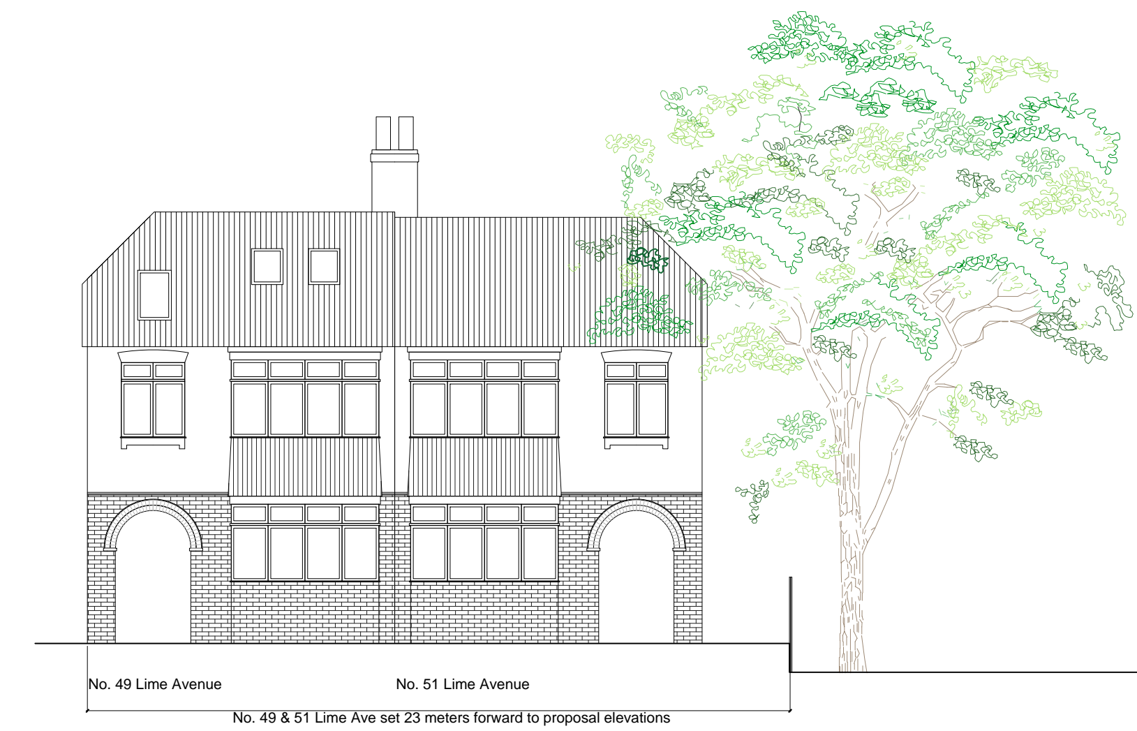
2020 CONSENT - INDICATIVE STREETSCENE - 1:100 0 1 2 3 4 5

PLANNING REFERENCE: 19/02289/FUL DATED 4TH MARCH 2020