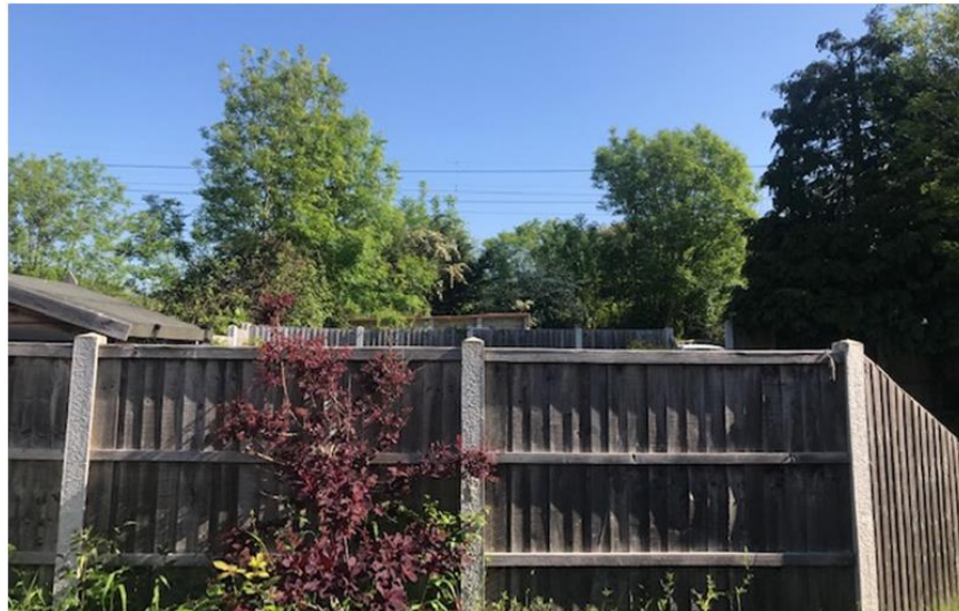
View from my garden - Before

An objector provided photographs with their own captions as follows: