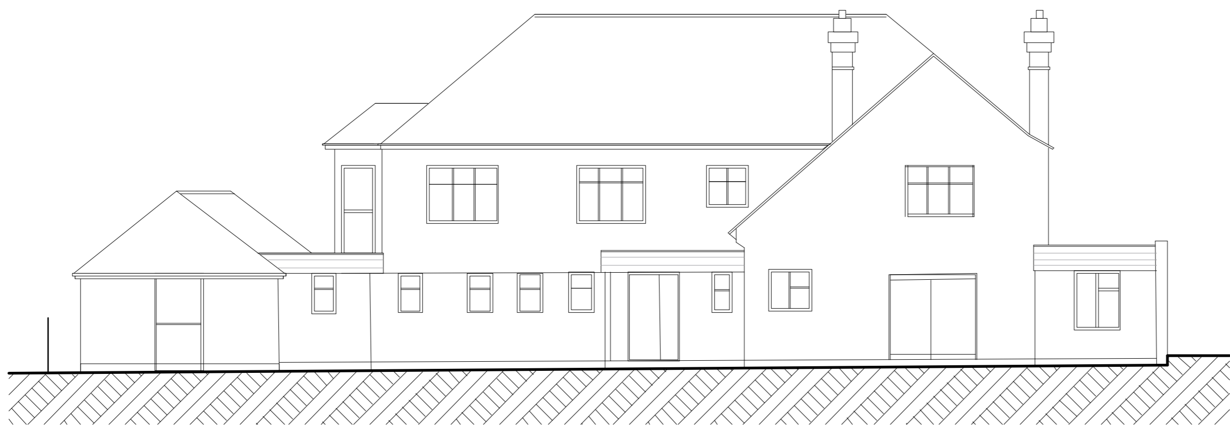
Existing West Elevation 1:100 (A2)

Note: Front entrance doors to have level access with clear door opening width of 775mm. All internal doors on the ground floor to achieve clear opening width of 750mm. All light switches to be positioned max 1200mm above finished floor level. All socket outlets, TV points & BT points to be positioned 450mm above finished floor level. All above to be provided to accord with part 'M' of Building Regulations.