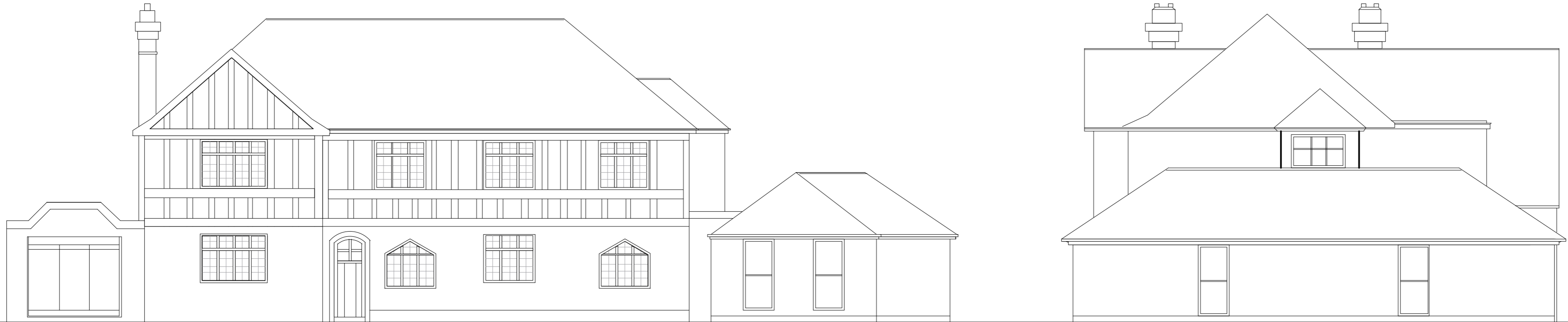
Existing East Elevation 1:100 (A2)