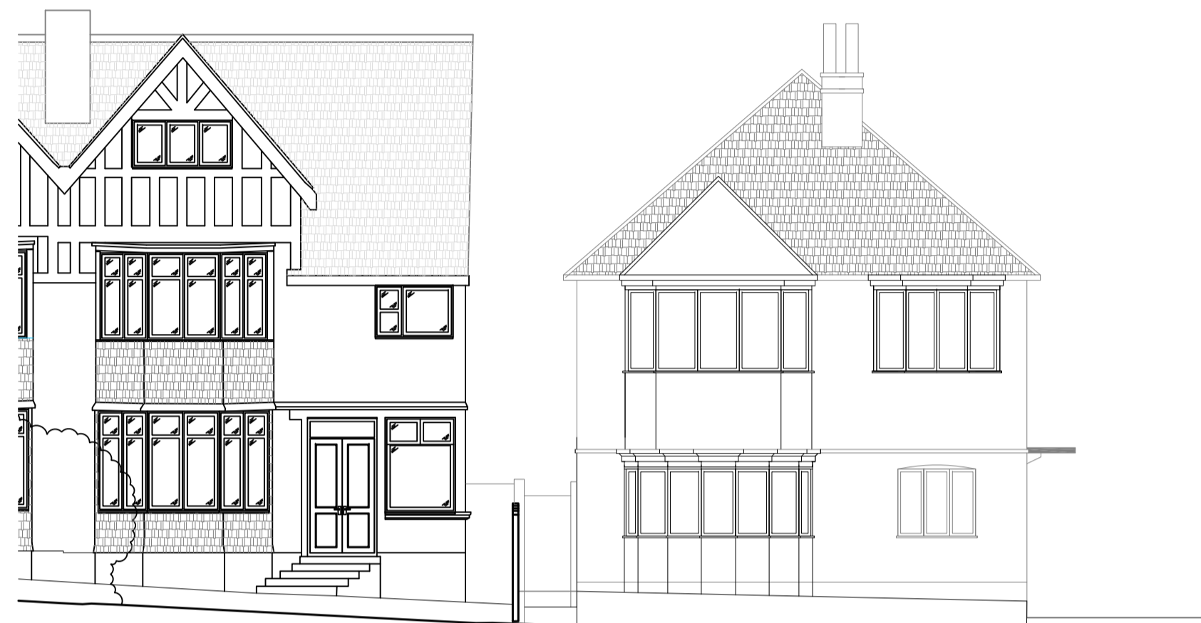
EXISTING Front Elevation Scale: 1:100