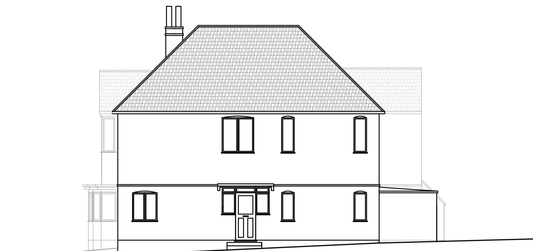
EXISTING Side Elevation Scale: 1:100