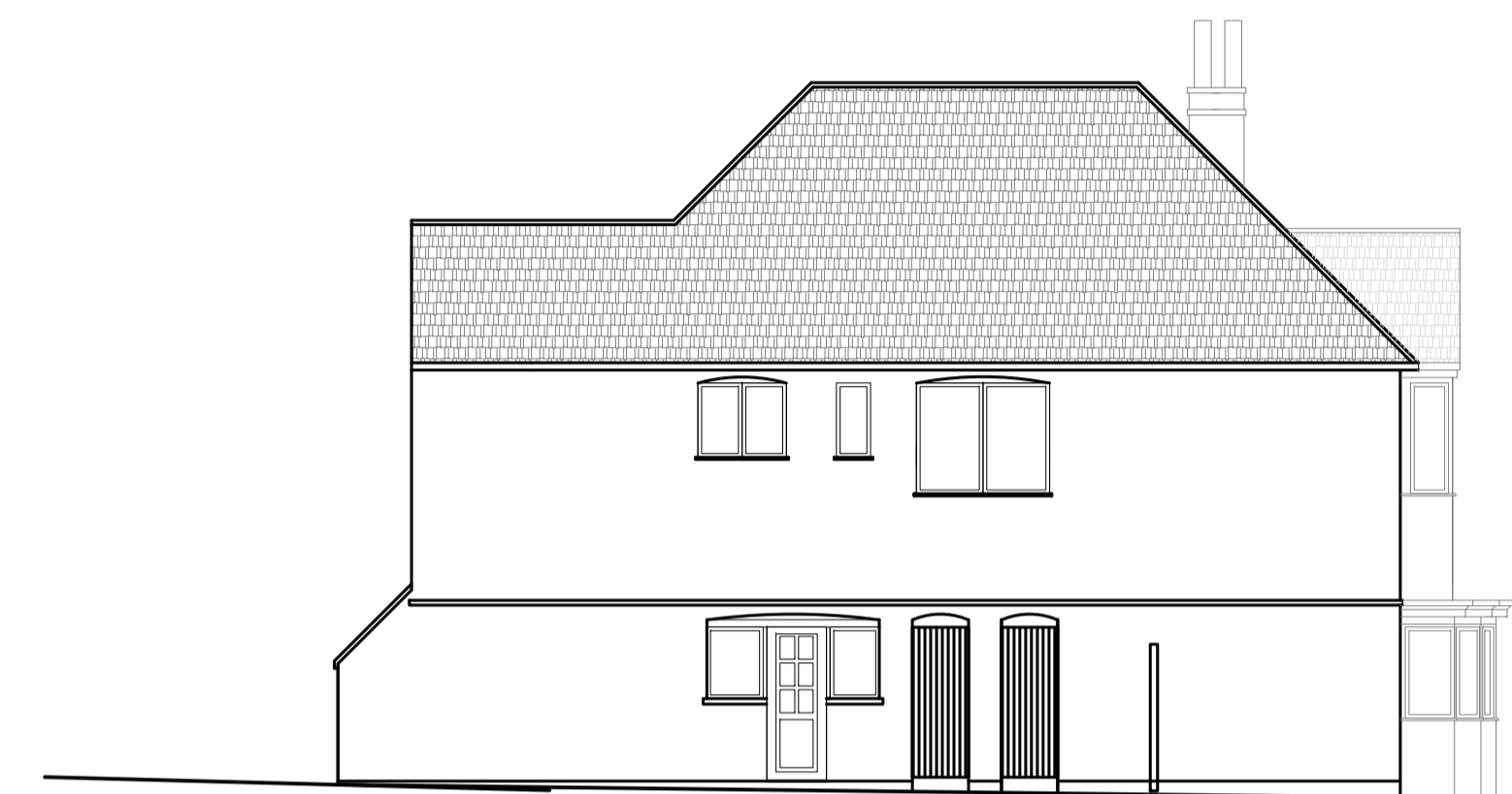
EXISTING Side Elevation Scale: 1:100