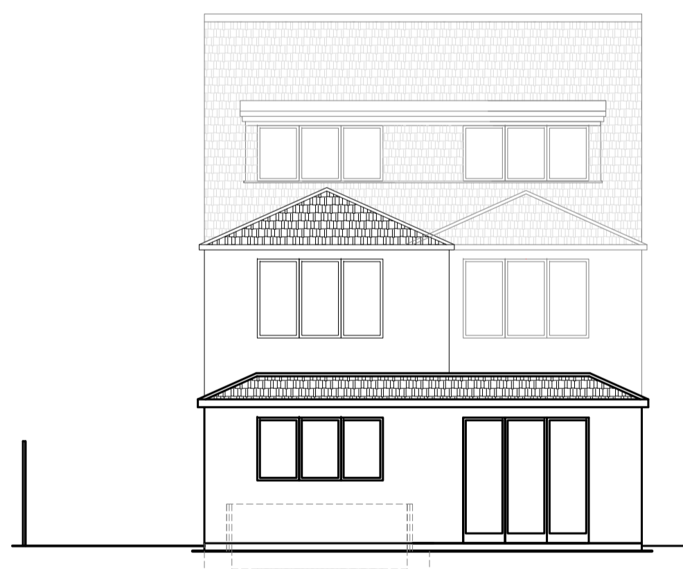
PROPOSED Rear Elevation Scale: 1:100