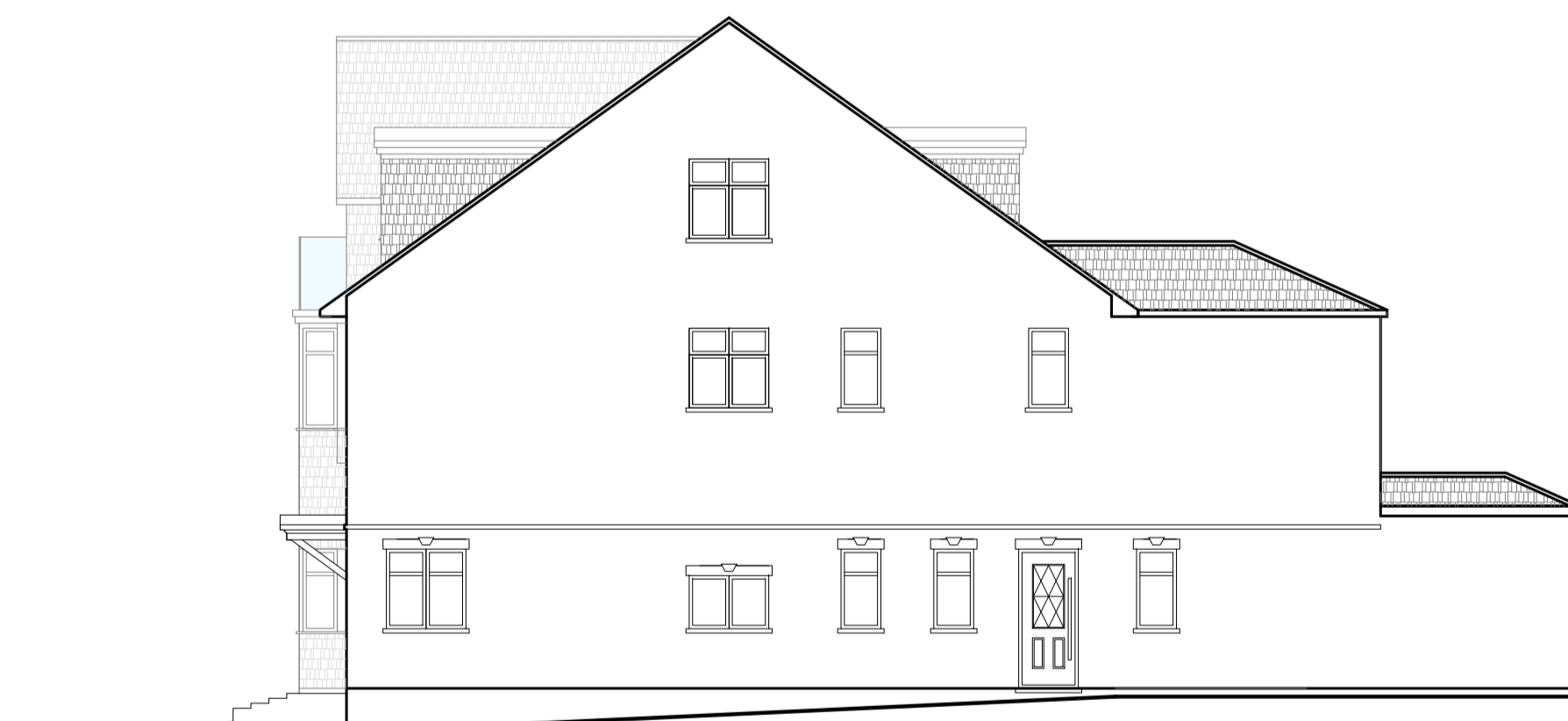
PROPOSED Side Elevation Scale: 1:100