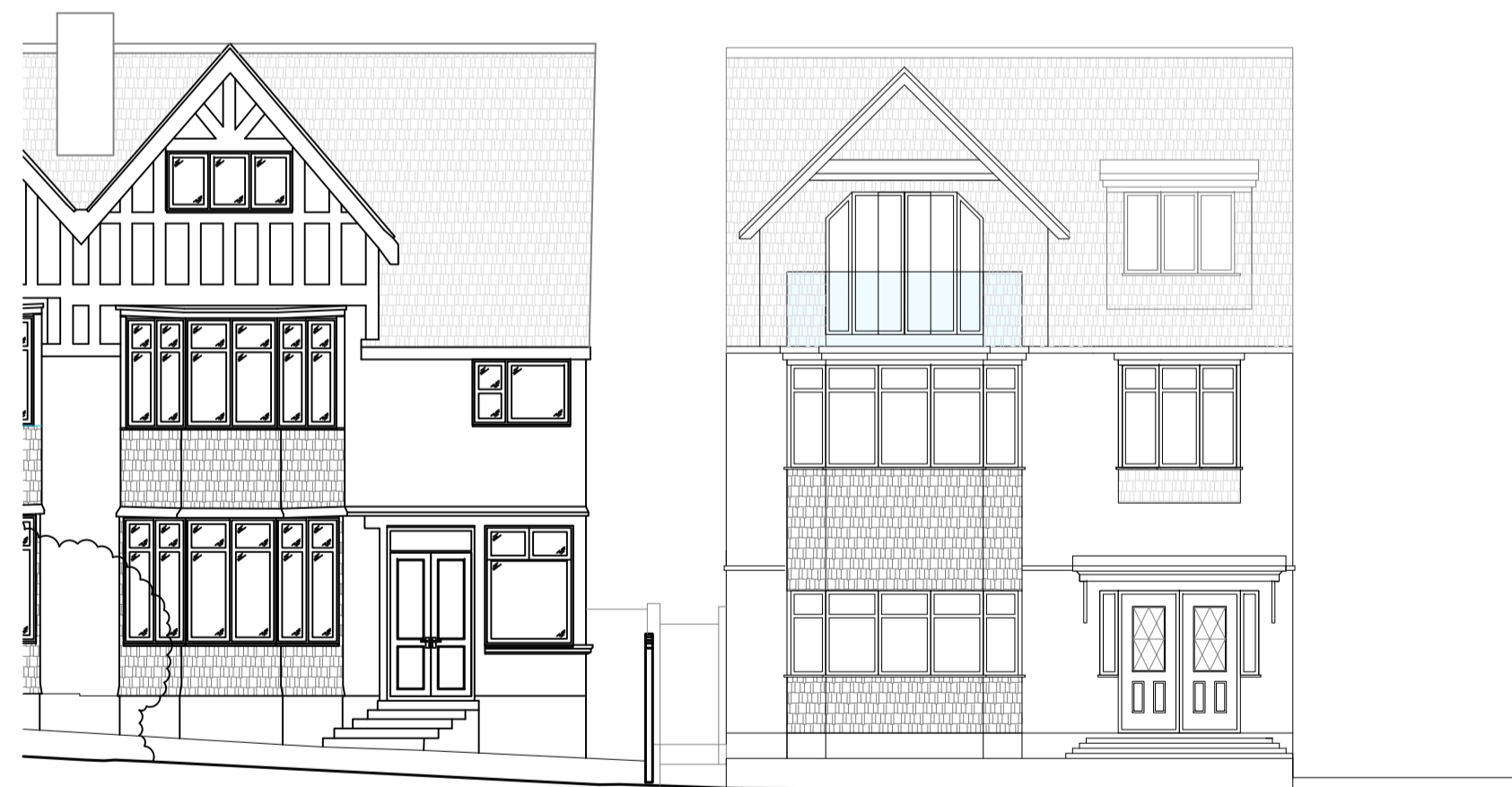
PROPOSED Front Elevation Scale: 1:100