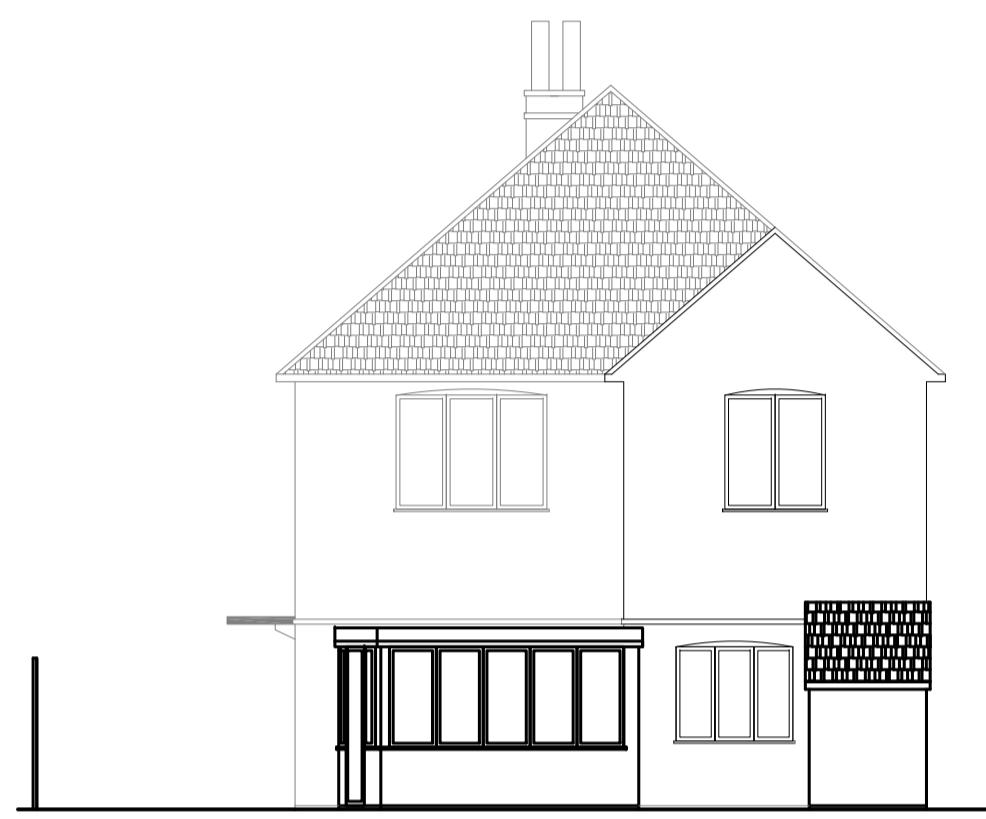
EXISTING Rear Elevation Scale: 1:100