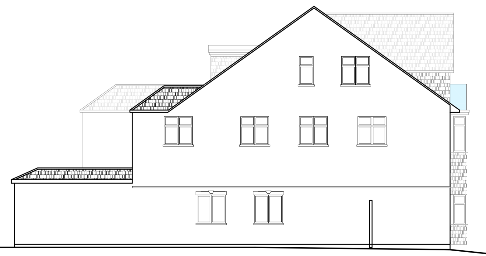
PROPOSED Side Elevation Scale: 1:100