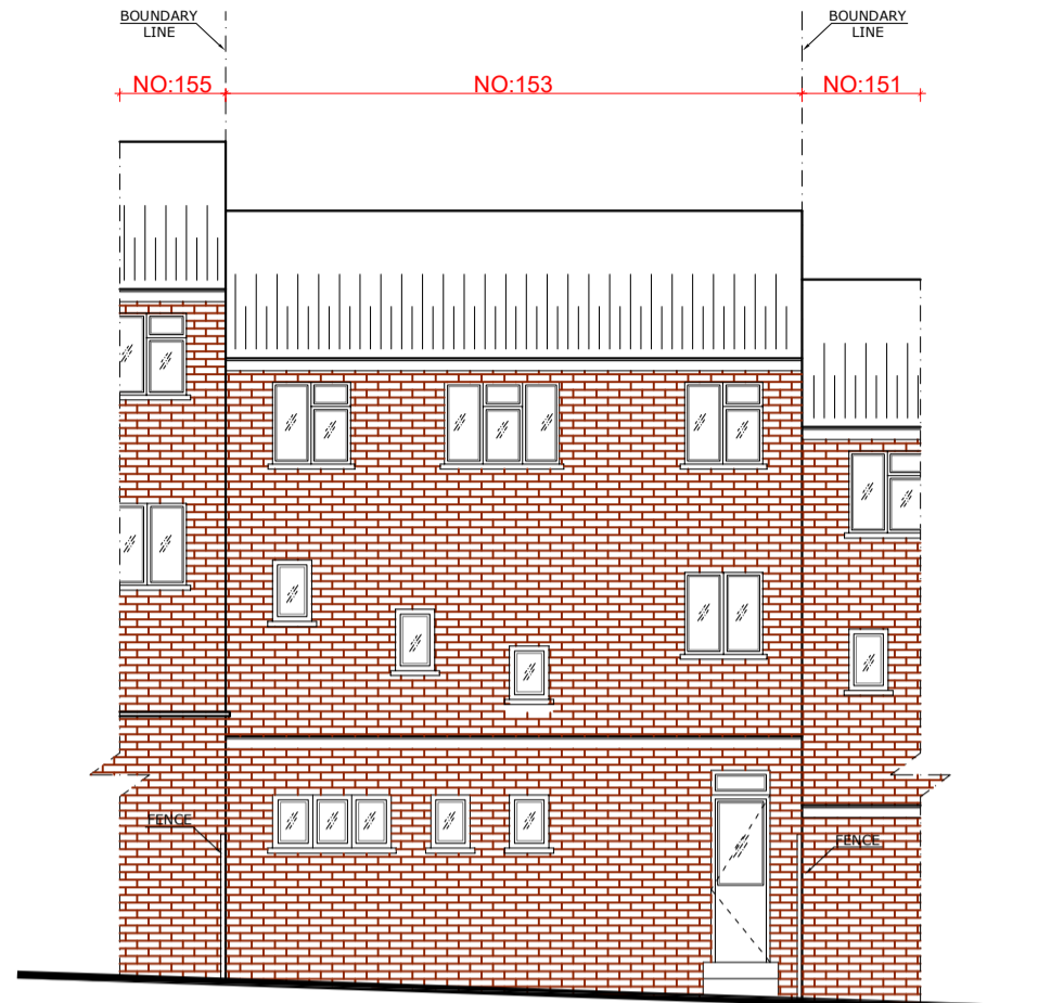
EXISTING REAR ELEVATION SCALE: 1/100 @A3