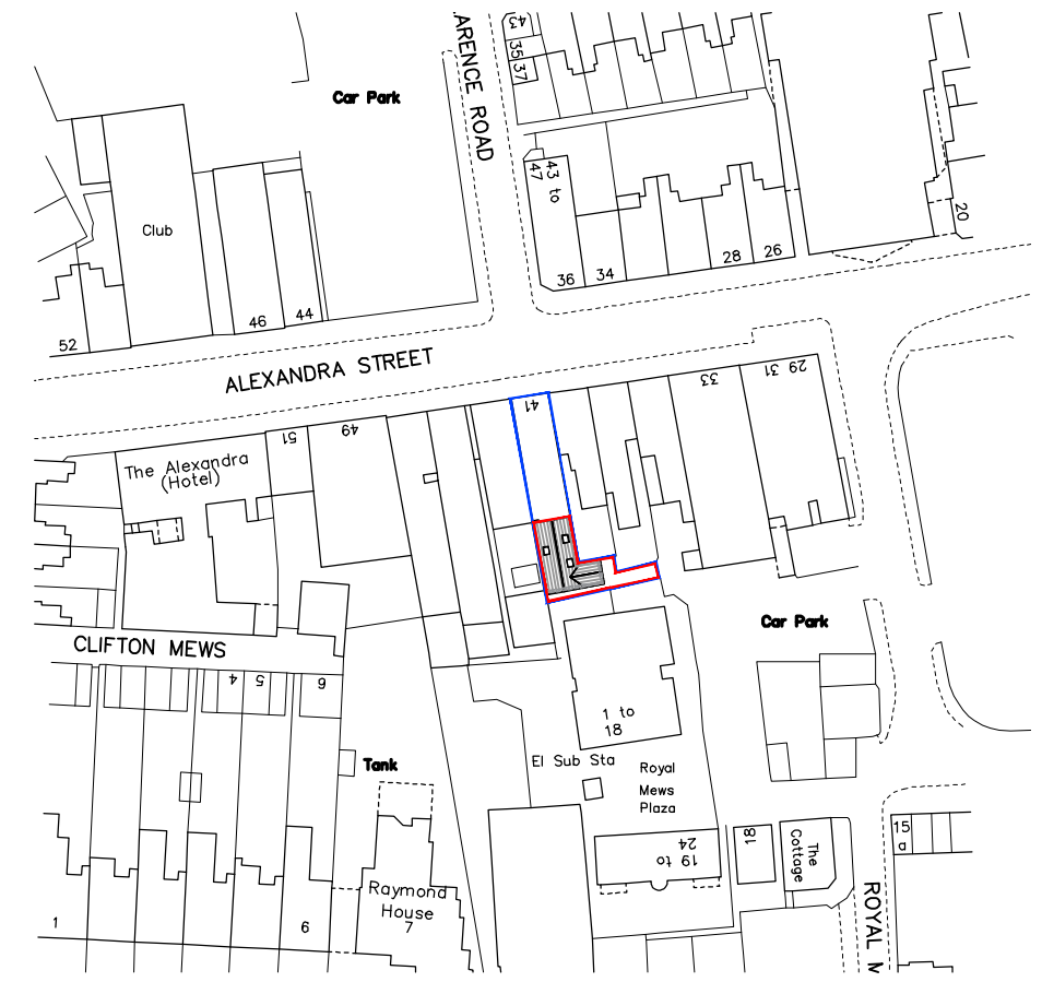
2 Location Plan