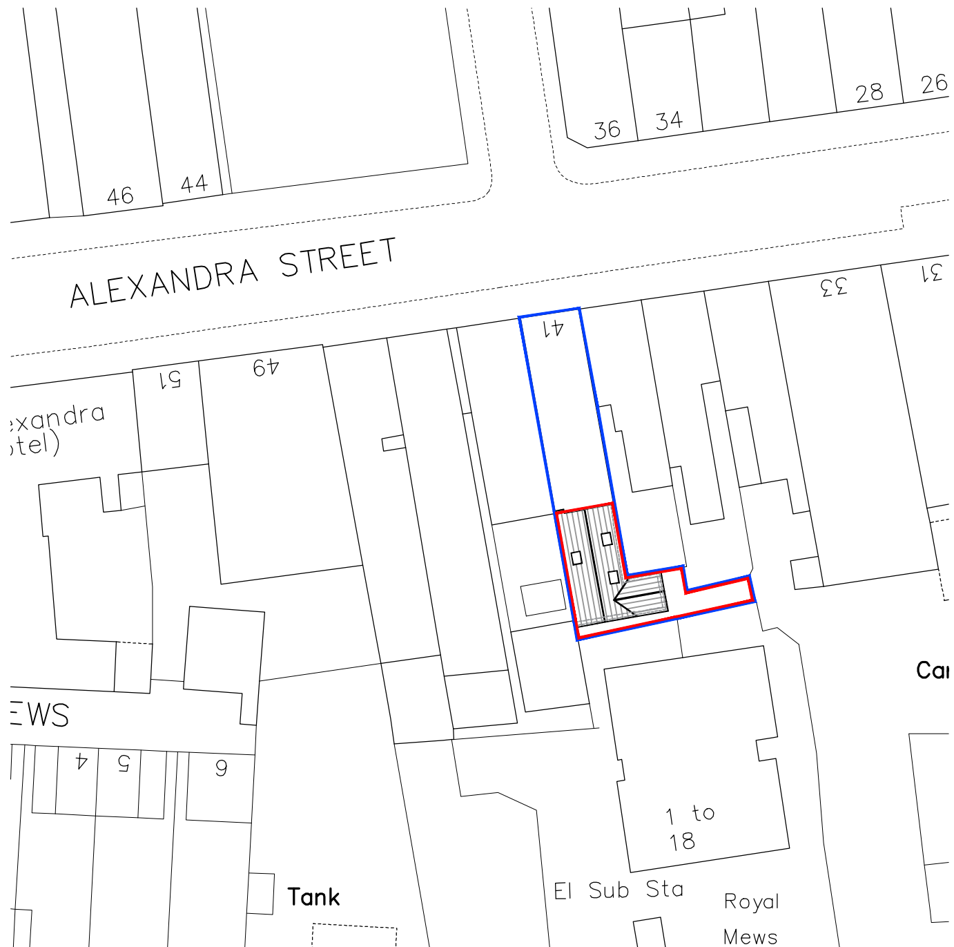
1 Site Plan