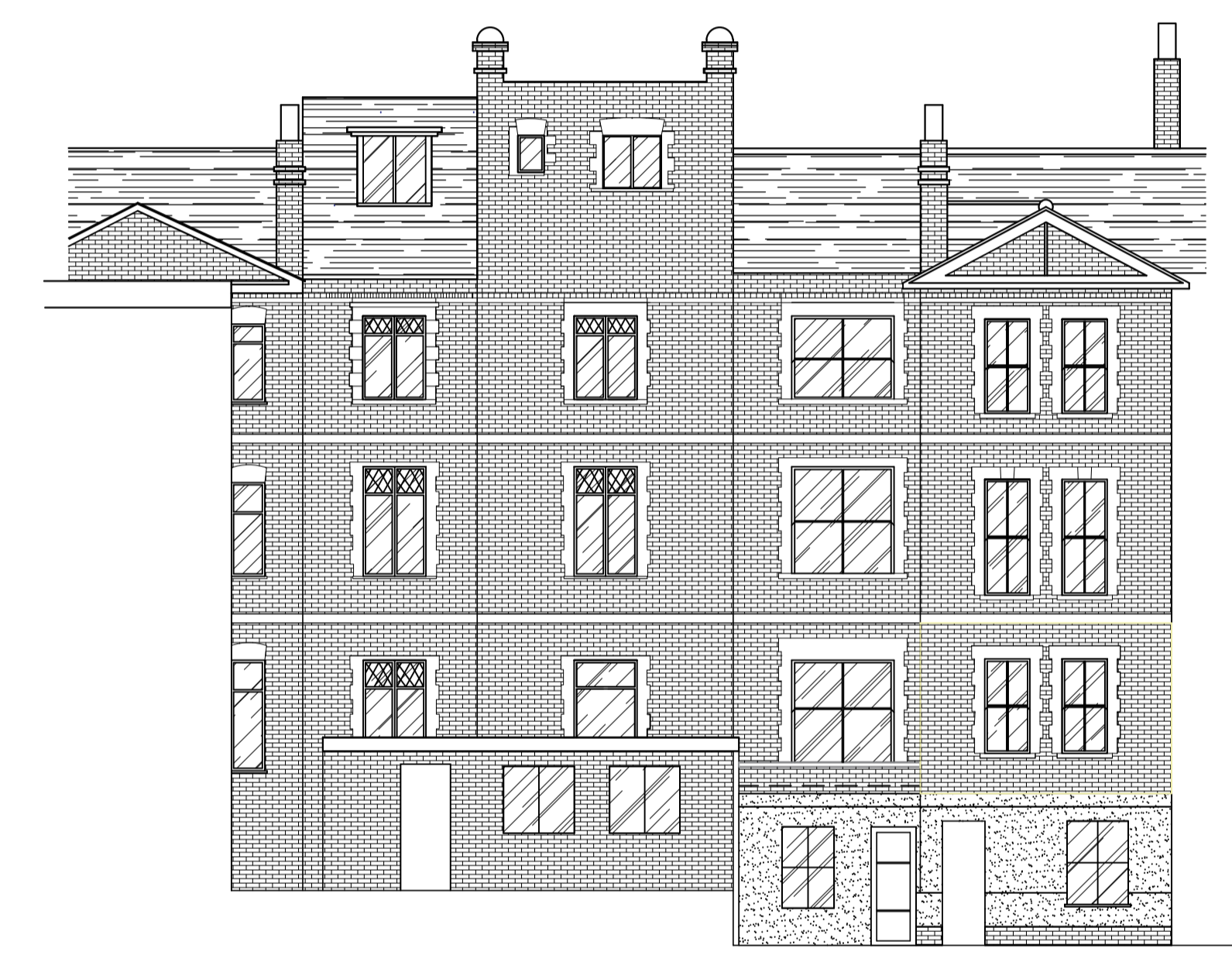
Existing South (Rear) Elevation Scale 1:100 @ A1