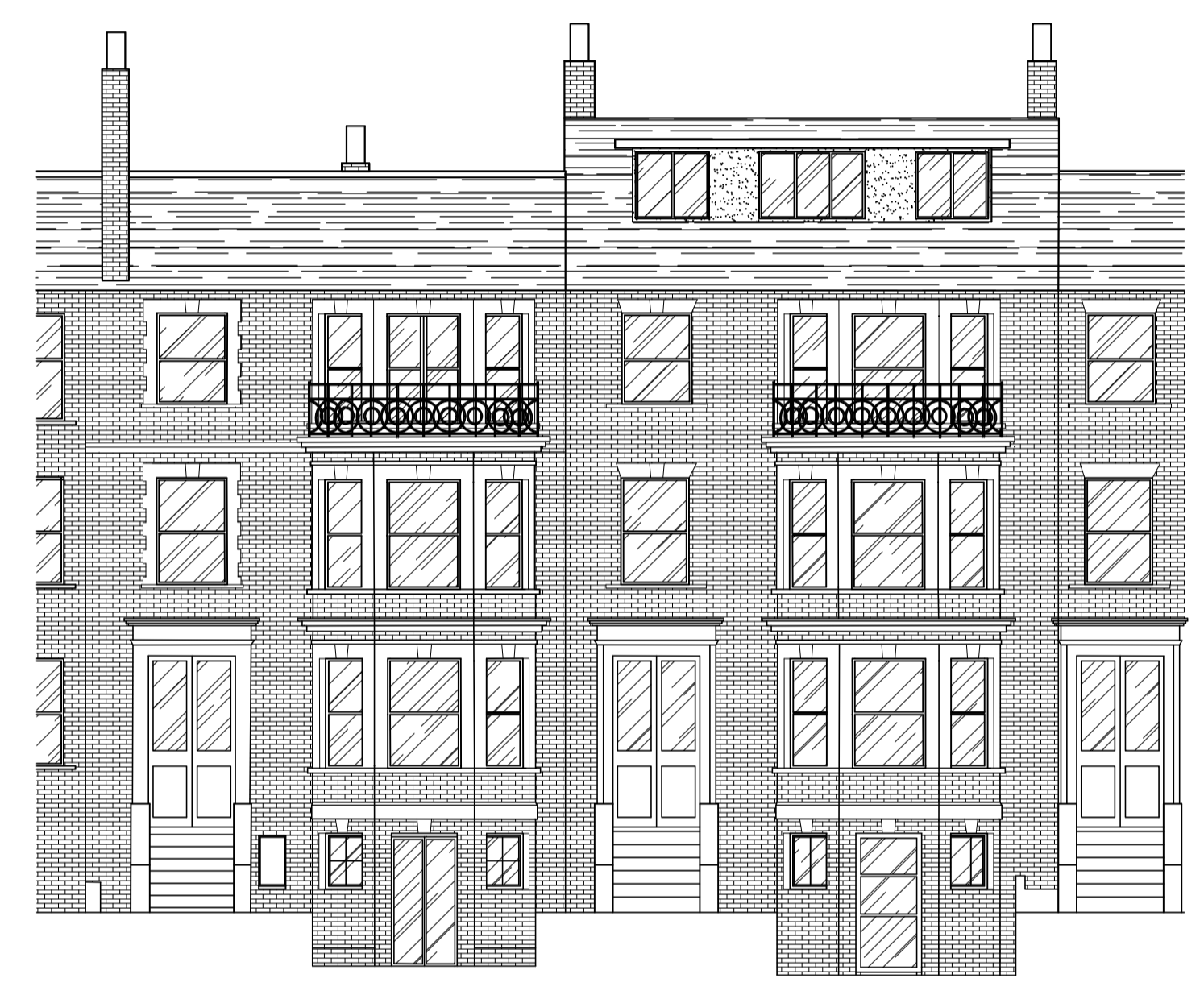
Existing South (Front) Elevation Scale 1:100 @ A1